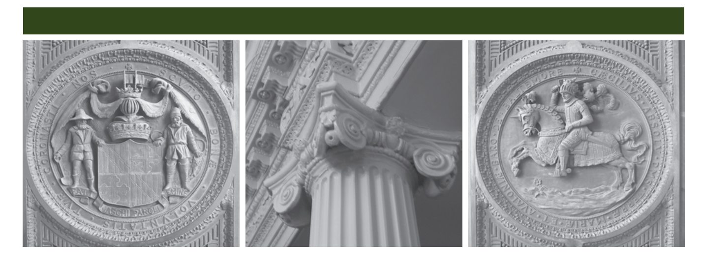
DEPARTMENT OF LEGISLATIVE SERVICES 2013