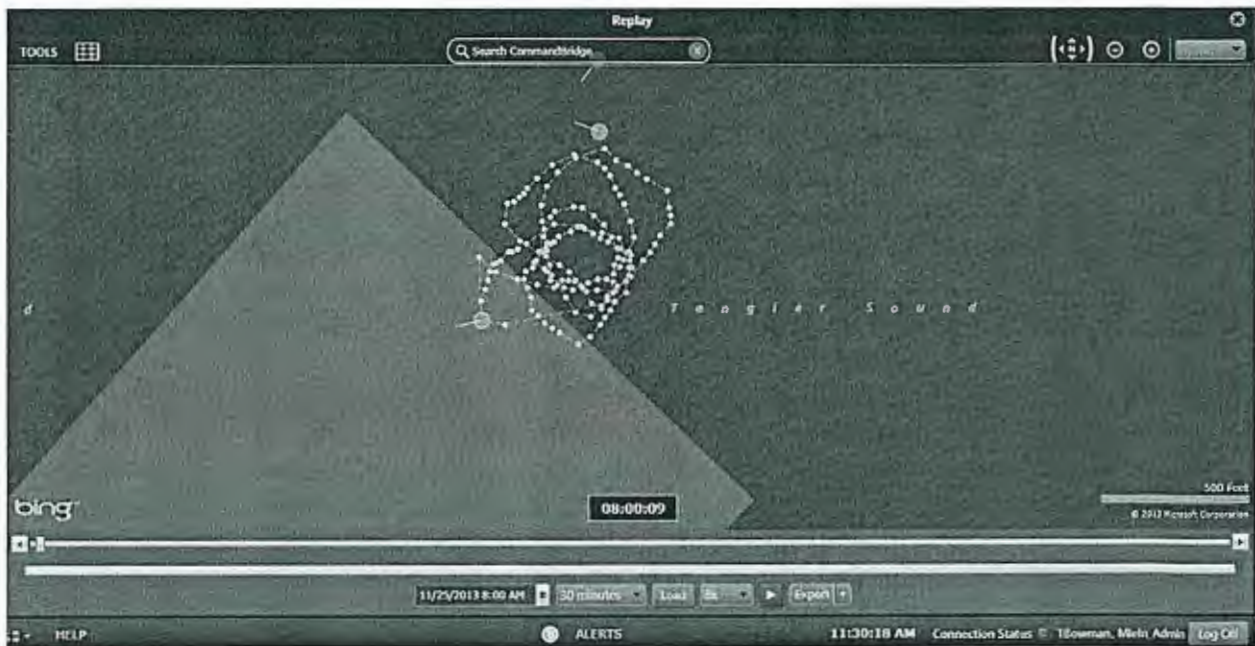
Exhibit 1 MLEIN in Action

Note: A screen shot from the Maritime Law Enforcement Information Network (MLEIN) shows the movements of a vessel (dotted line) operating on the border of an oyster sanctuary (light gray area).