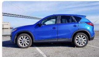
SUV / Jeep