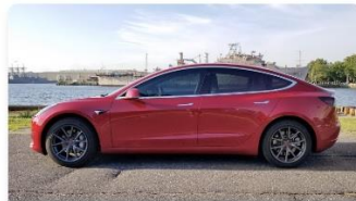
Sedan / Coupe

Convenient hourly and daily rentals. Insurance included.