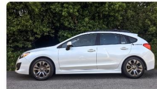
Hatchback / Wagon