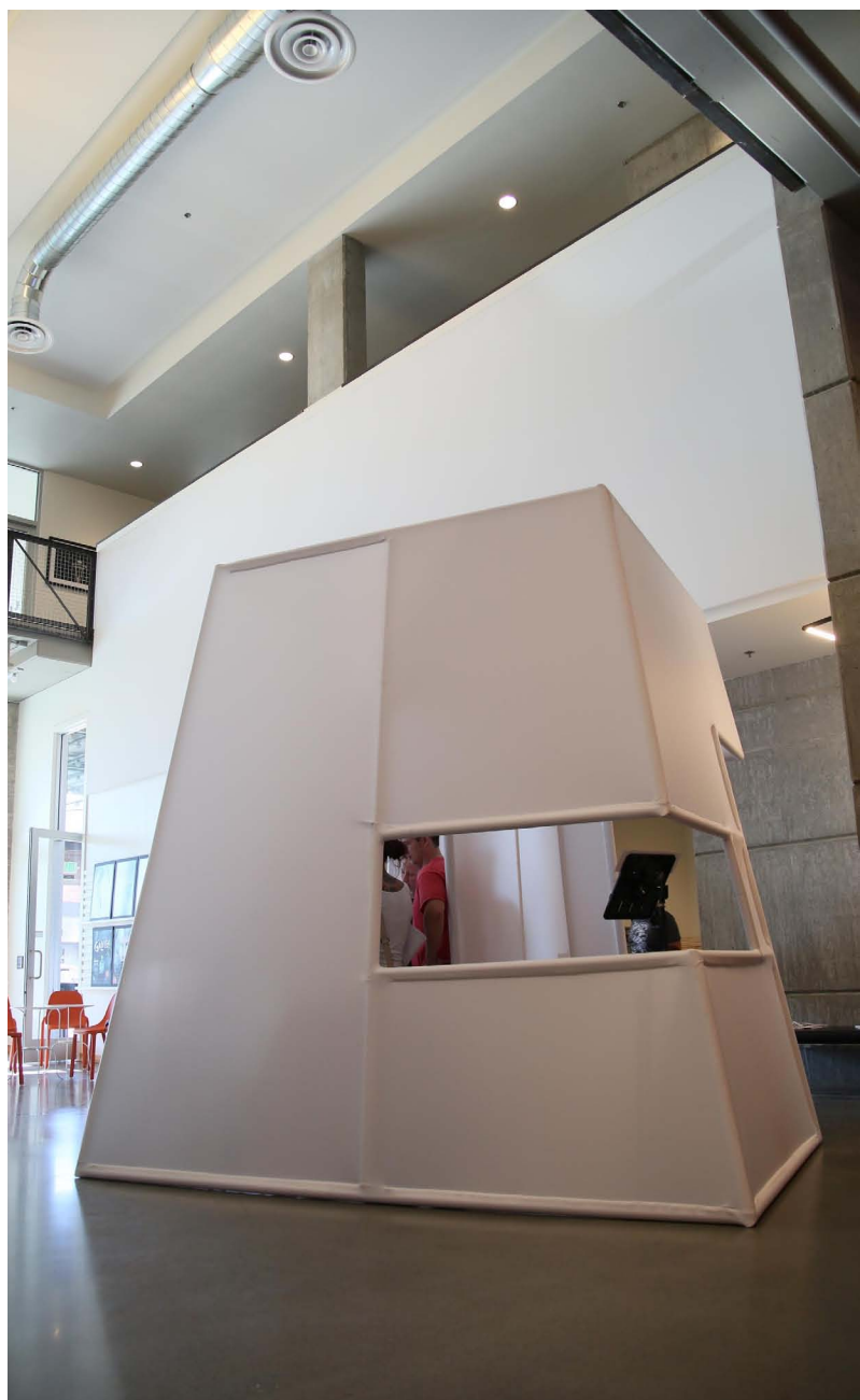
One of many SAFE SPACE installations

The themes over the next four pages emerged, and should be considered by all when planning and, when the time comes, operating a SCS.