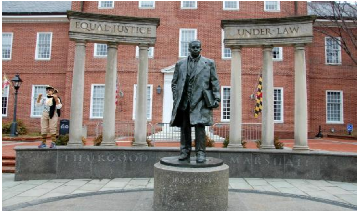
Supreme Court Justice Thurgood Marshall