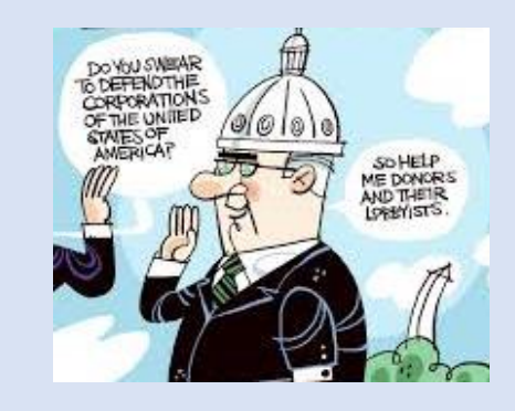
Wealthy elites have won lower tax rate for dividends and capital gains compared to wages.<sup>3</sup>