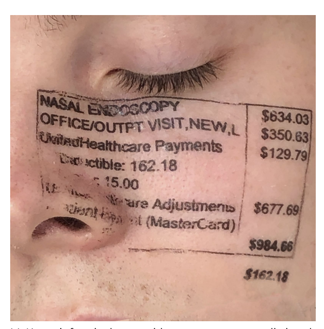
Image description: Declan McKenna's face is shown, with a temporary tattoo listing the surgery costs for a "Nasal Endoscopy" covering his skin. The total cost for the treatment being $984.66

Image description: Declan McKenna's Commerce art series. This work is also viewable at <a href="https://declanmckenna.com/medicaldebt">https://declanmckenna.com/medicaldebt</a>.