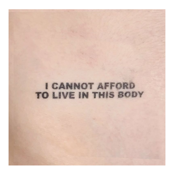
Image description: A patch of skin is shown, with the text "I cannot afford to live in this body" printed directly onto the body.

Image description: Declan McKenna's neck is shown, with an emergency medical treatment for $200.00 shown.