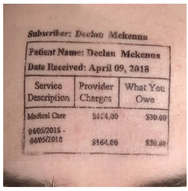
Image description: Declan McKenna's forehead is shown, with a medical bill listing $30.00 printed on his skin.