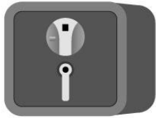
Safe or lockbox for handguns

Gun safes can lower the risk a curious child will be hurt: