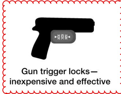
Gun trigger locks— inexpensive and effective