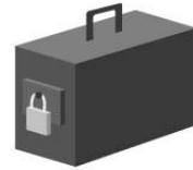
Lock box for ammo