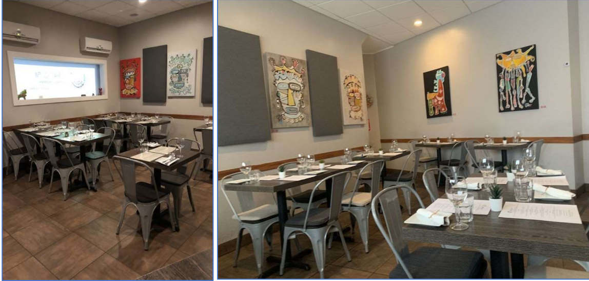
Interior of Puerto 511, which operate with BYOB privilege because it has fewer than 50 seats