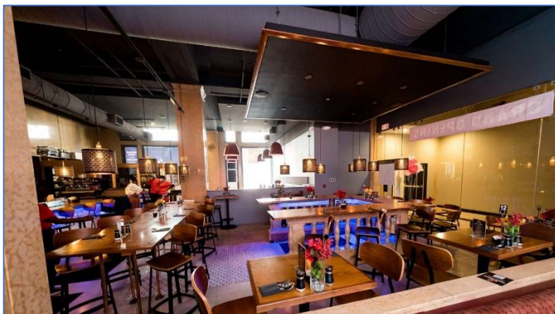
Interior of Hoodfellas Bistro, which was forced to buy a Class D (Tavern) License, despite being a restaurant, because it did not meet minimum threshold capital investment requirement for a Class B License in Ward 4, Precinct 1.