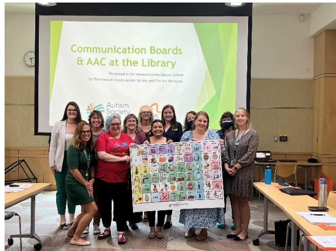
Dedication of boards at Waverly Elementary School in 2020 and Howard County Public Library in 2023.

LINK TO YOUTUBE VIDEO: https://www.youtube.com/watch?v=3DpKoy2bTxQ