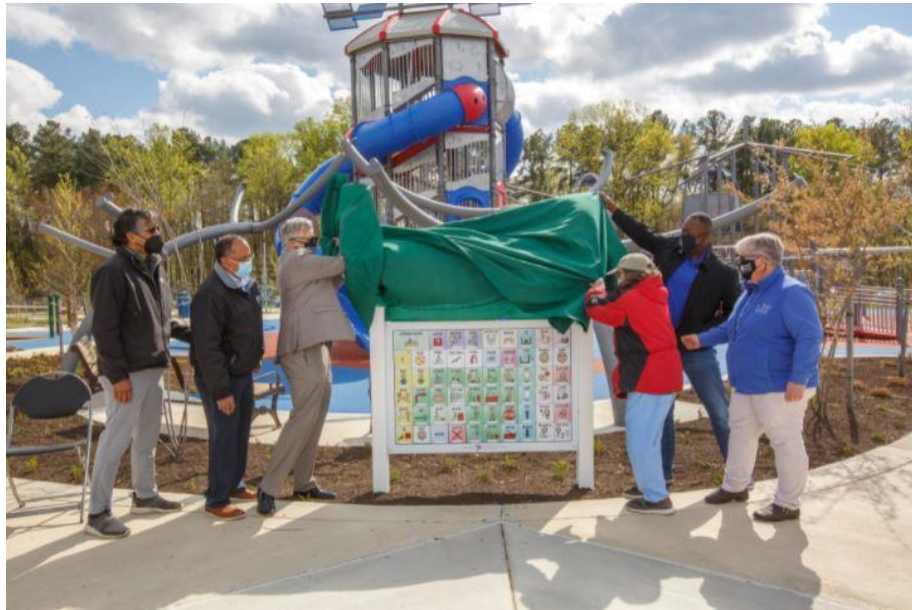
Dedication of Boards at Blandair Park in Columbia, MD (2021)