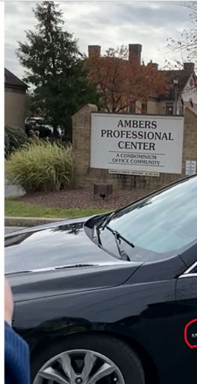
Known assailant in Frederick County assault. License plate blurred but reported to police.