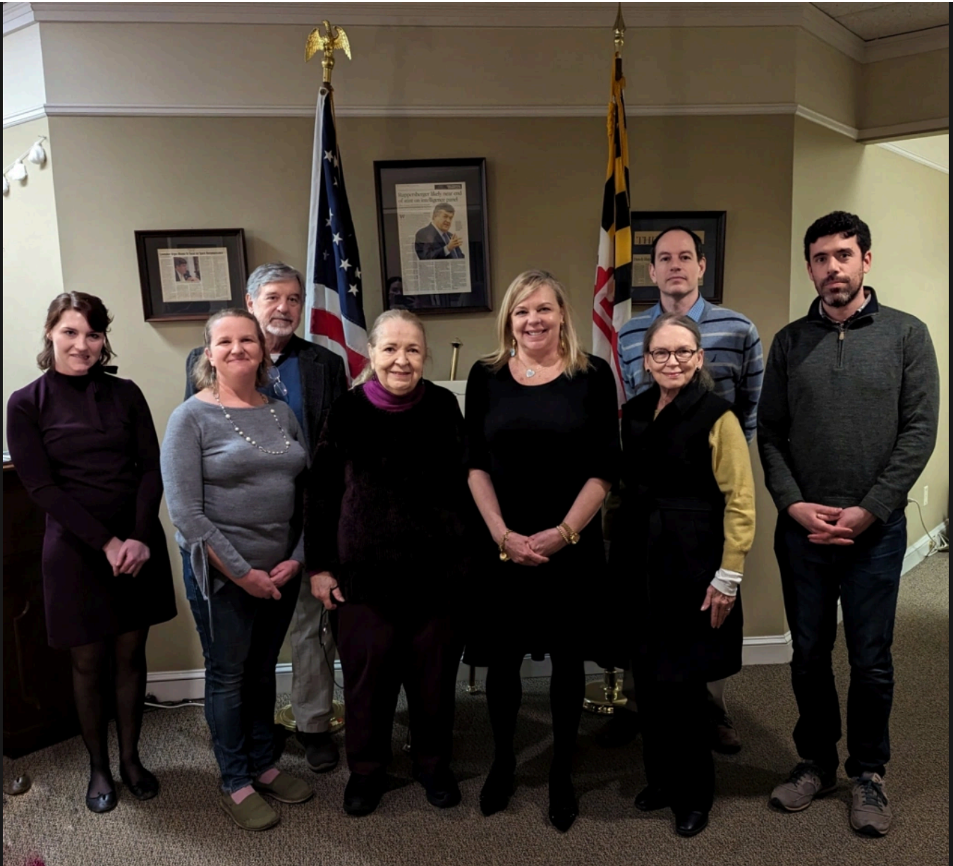
Signatories meet with Rep. Dutch Ruppersberger's staff on Feb 12, 2024