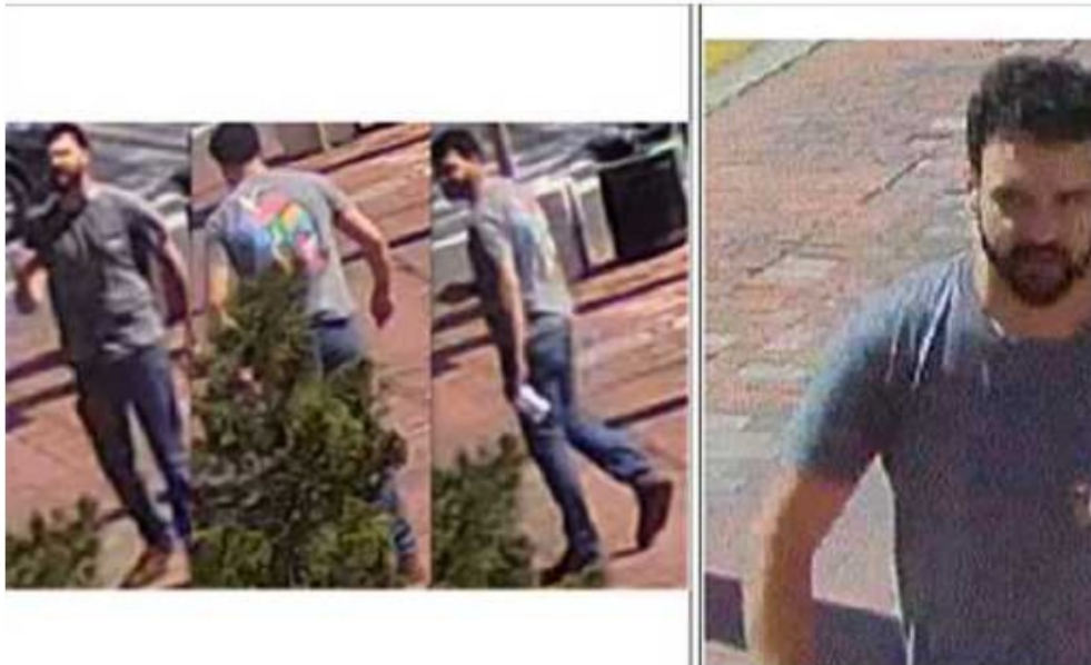
Police were provided with video evidence of the abortion terrorist. No arrest has been made.