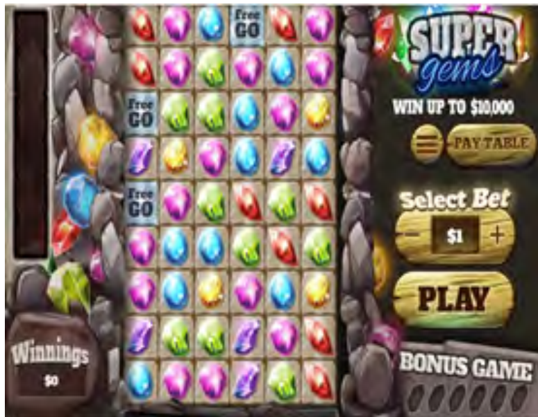
iLottery Super Gems