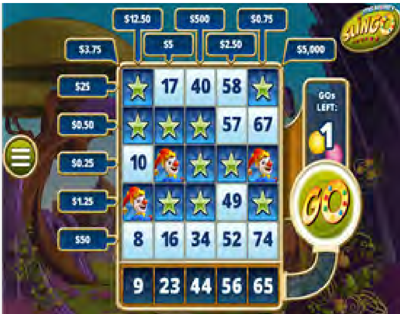
iLottery Slingo Big Money