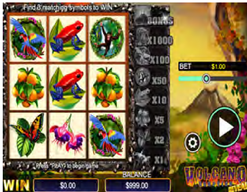
iLottery Volcano Eruption