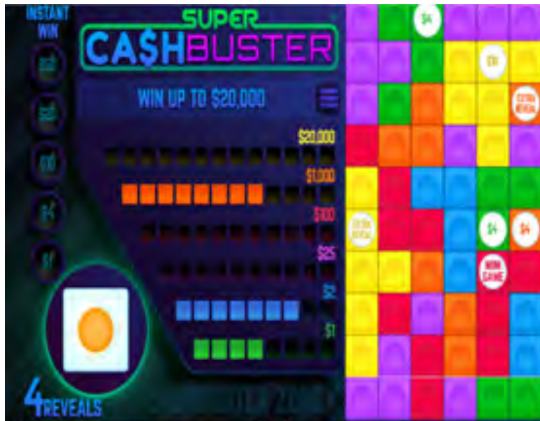
iLottery Super Cash Buster