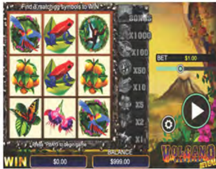
iLottery Volcano Eruption