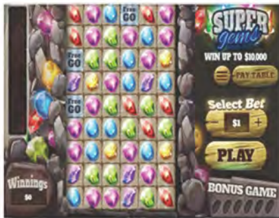
iLottery Super Gems