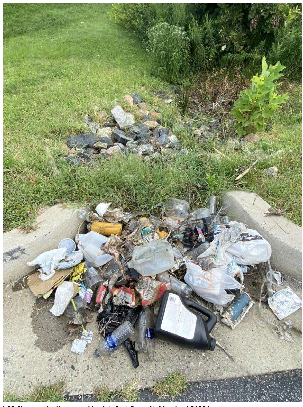
I-95 Chesapeake House parking lot, Port Deposit, Maryland 21904