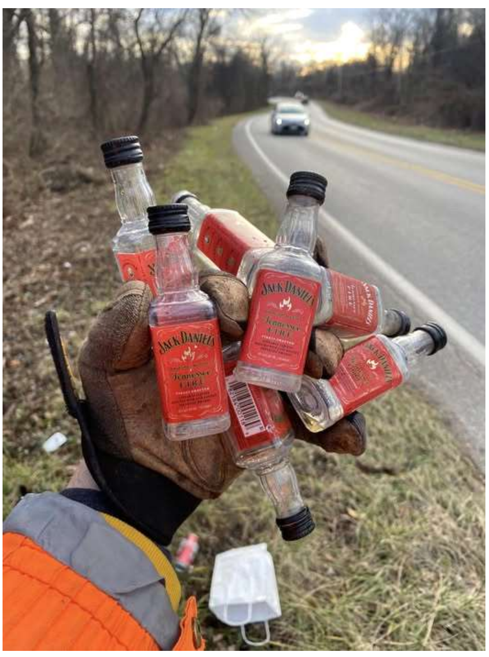
Hammonds Ferry Road, Patapsco Valley State Park, Halethorpe, Maryland 21227