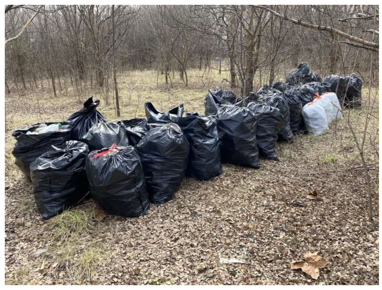
Plastic container cleanup @ Colgate Creek, Fort Holabird Park, Baltimore Maryland 21224