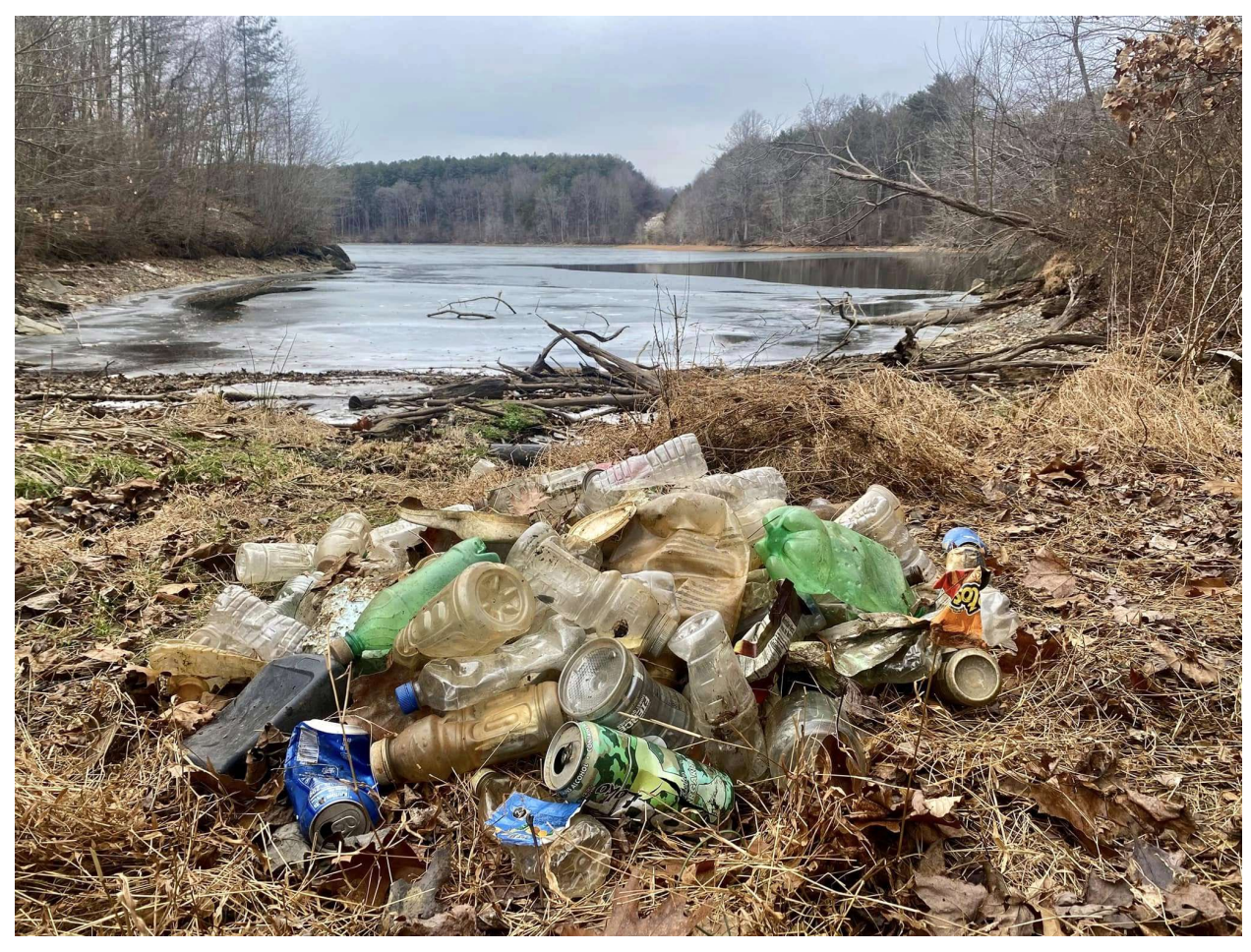
Liberty Reservoir @ Nicodemus Road, Reisterstown. Maryland 21136