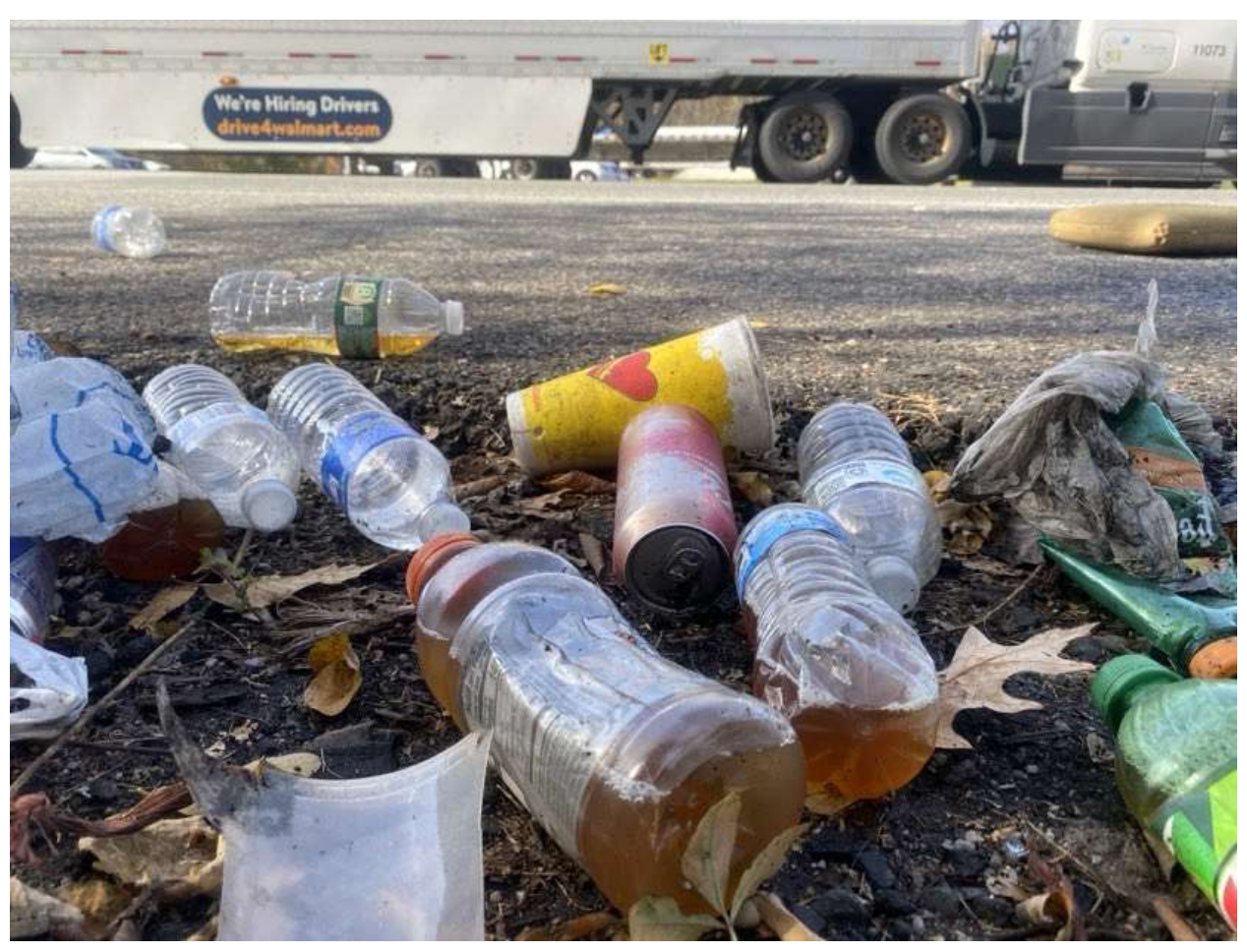
I-95 Maryland Welcome Center (Northbound), Laurel Maryland 20723