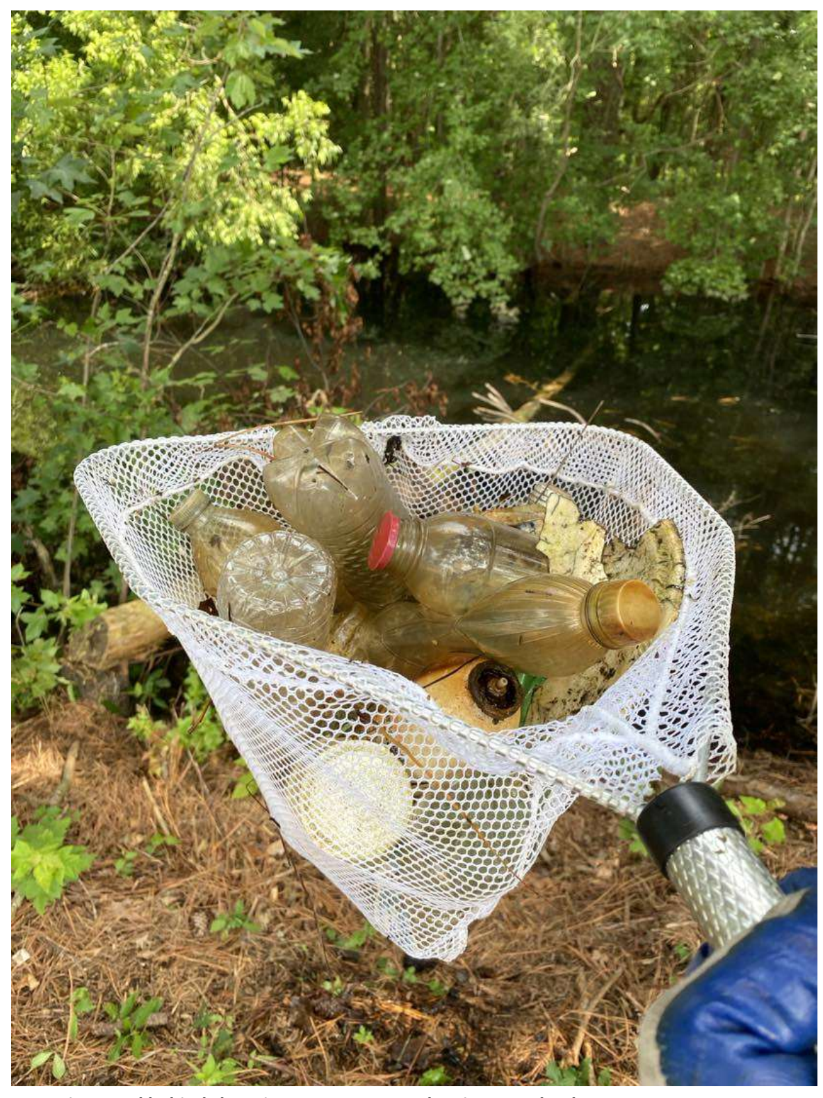
Retention pond behind shopping center, Pocomoke City, Maryland 21851