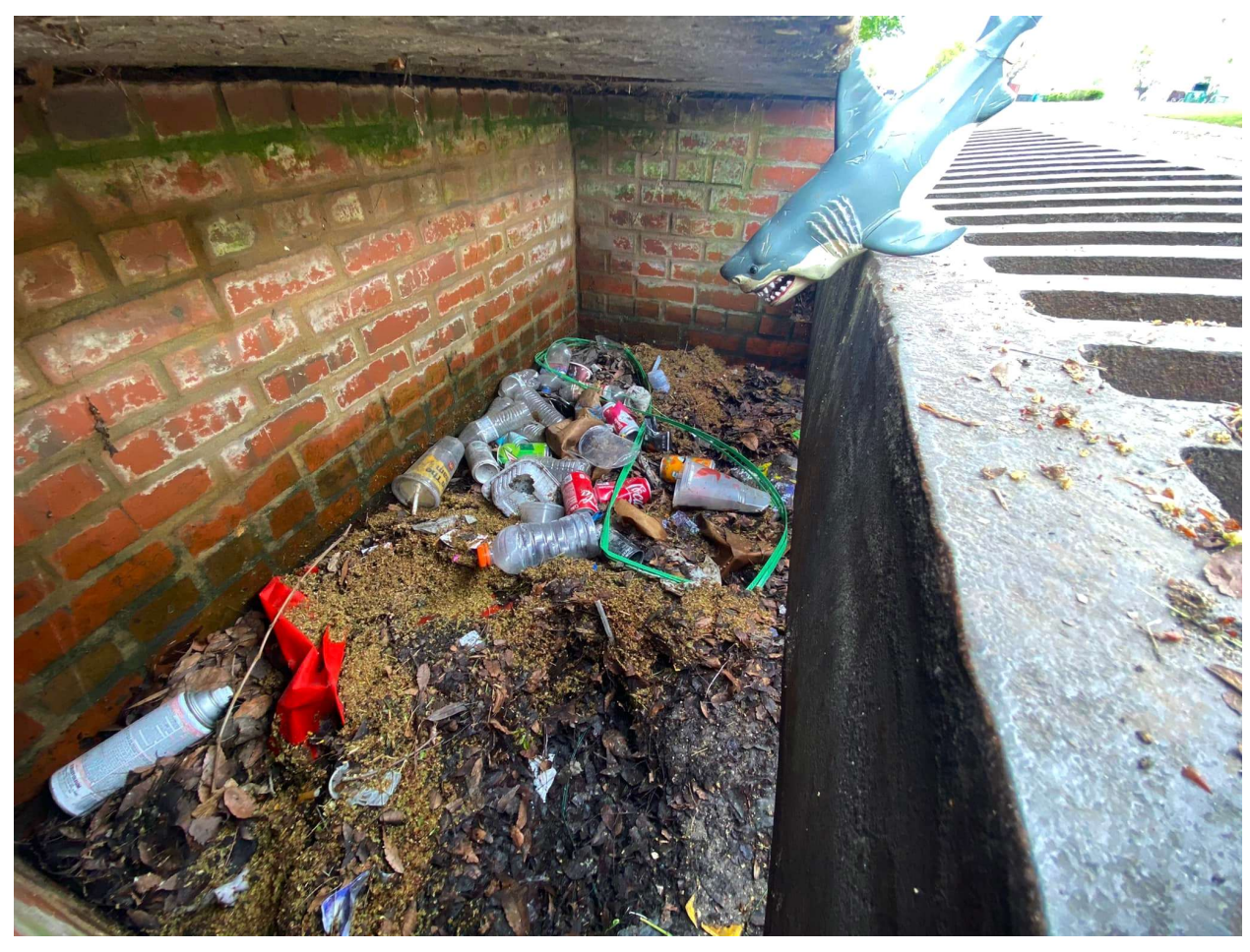
Beckley Street, Fort Holabird Park, Baltimore, Maryland 21224