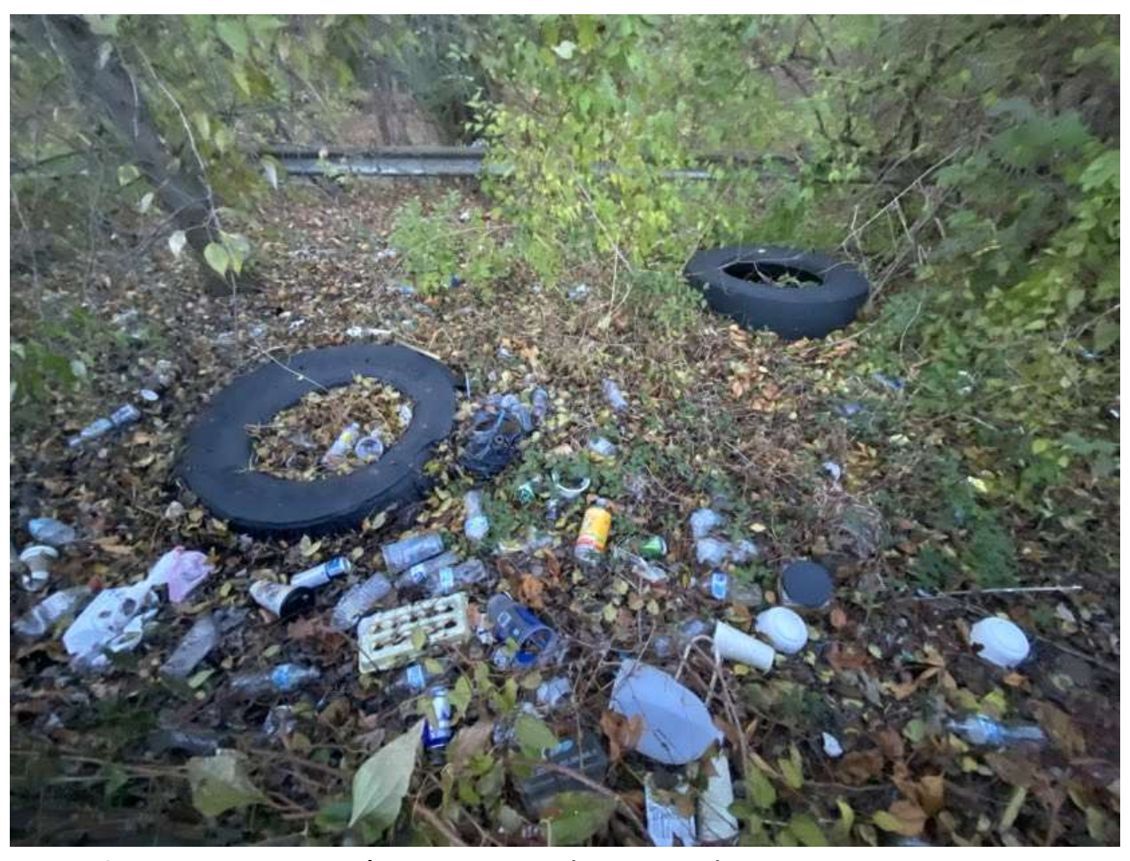
Makeshift truck rest area @ I-95/I-495 interchange (Paint Branch), College Park, Maryland 20740