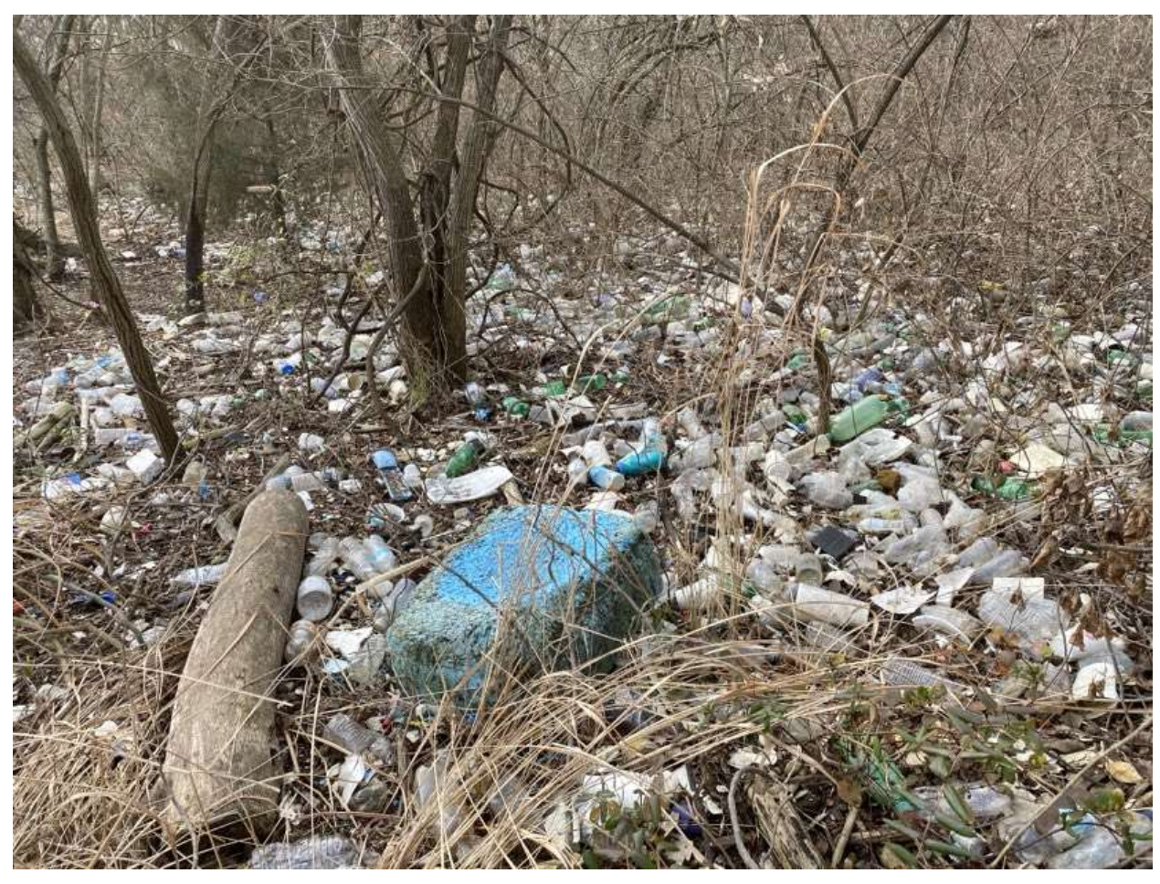
Colgate Creek, Fort Holabird Park, Baltimore Maryland 21224