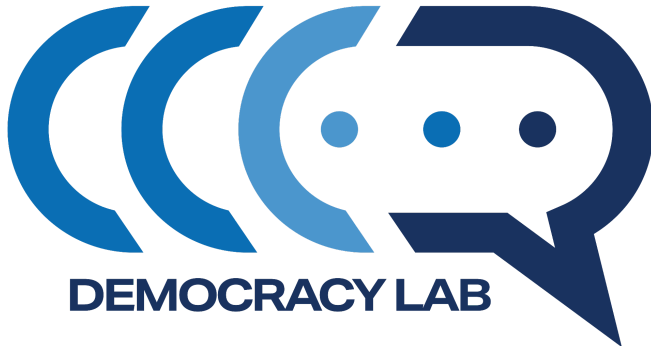
Carroll Community College Democracy Lab