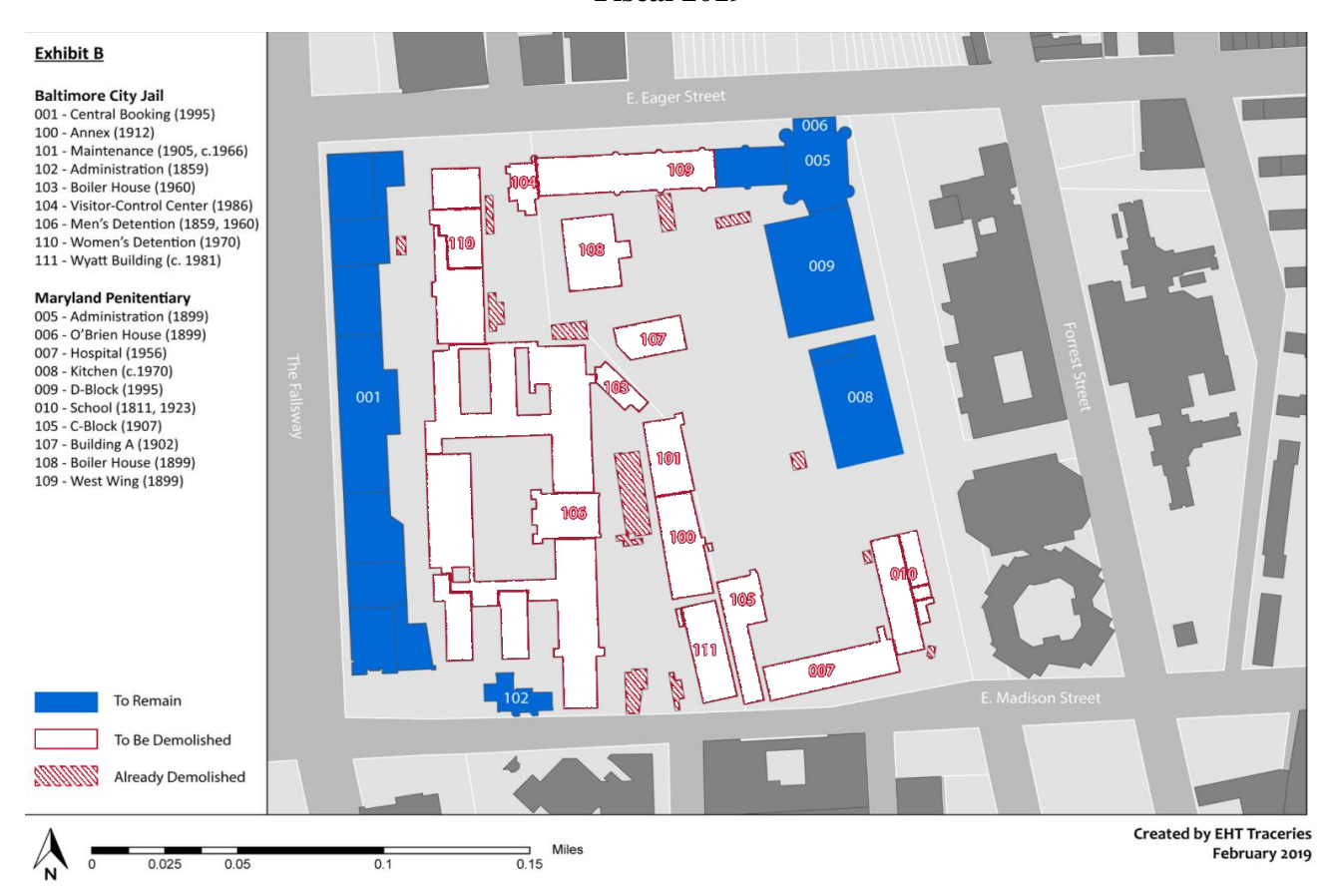
Exhibit 5 Baltimore City Correctional Complex (Demolition Area) Fiscal 2019