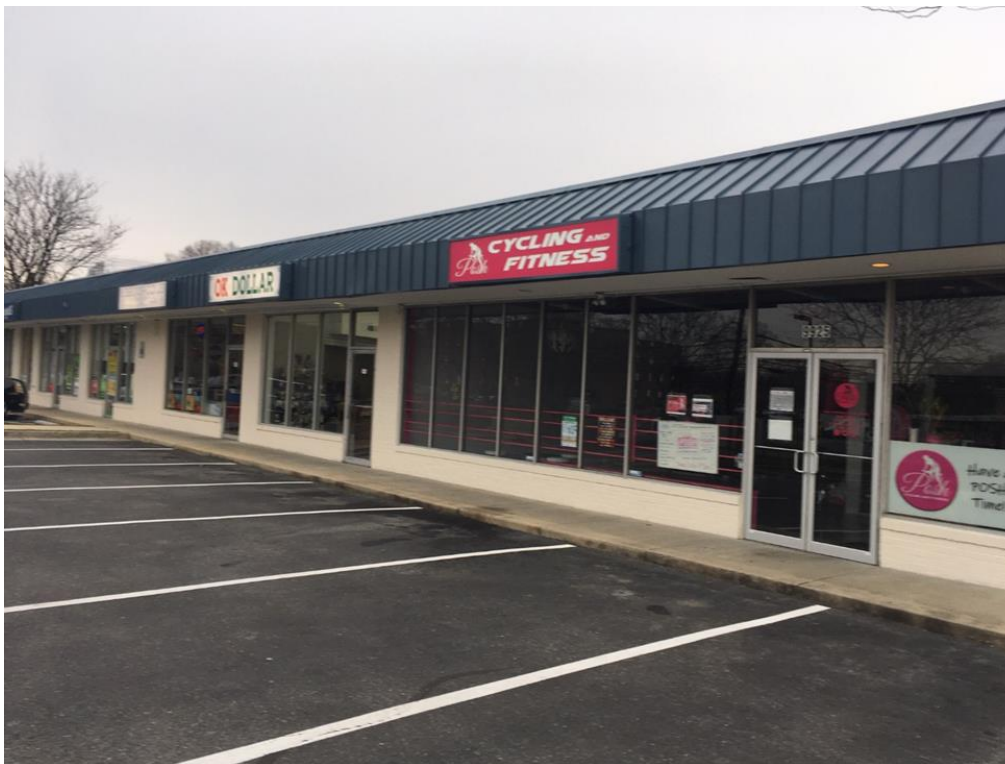
Neighborhood Old and New – Thrift Store (top), New Spin Studio (bottom)