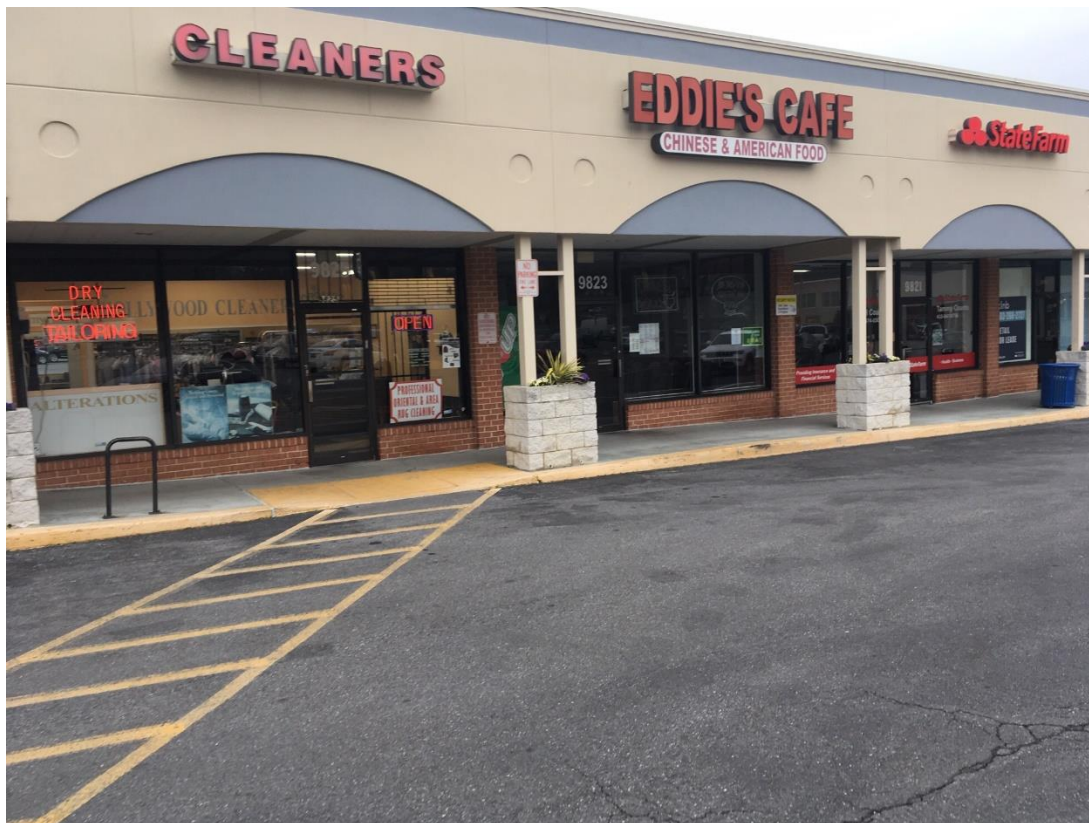
Hollywood Shopping Center