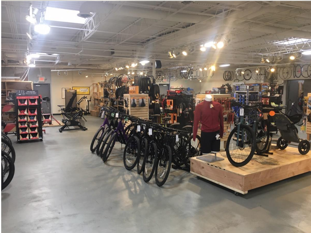
Inside the Bike Shop