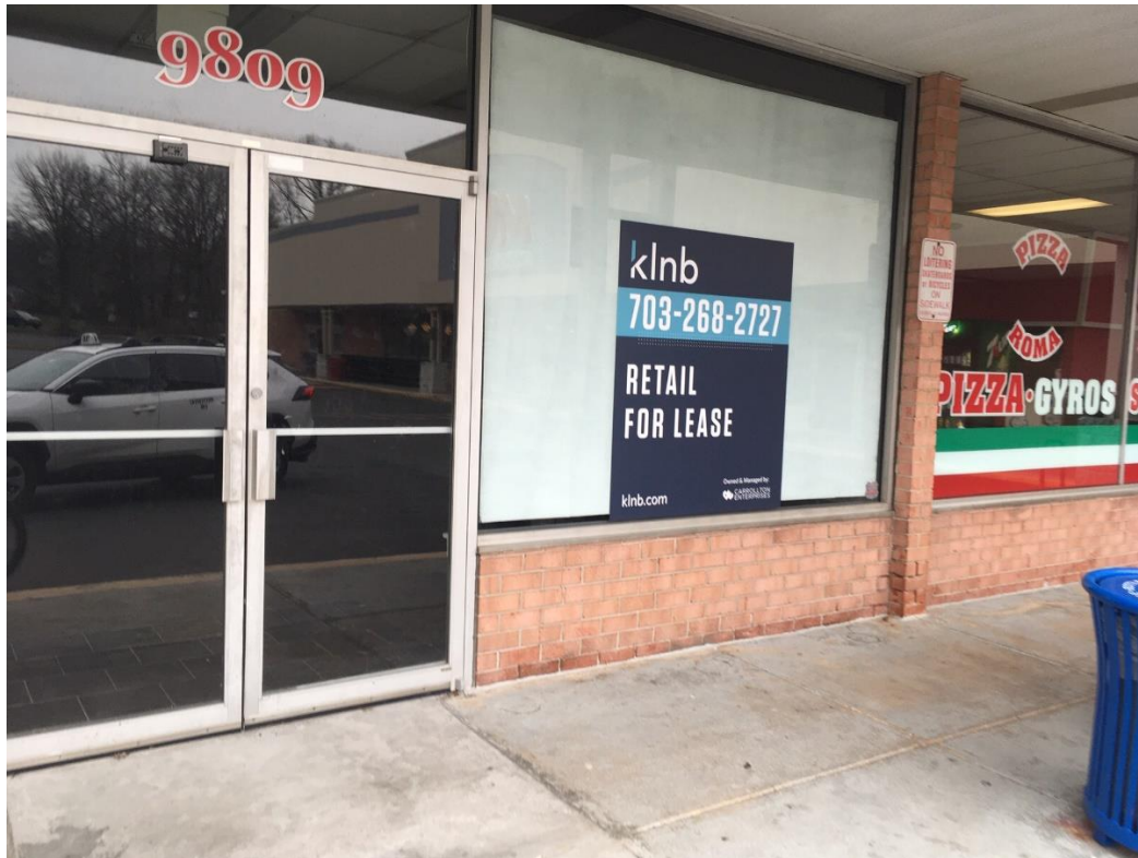
Vacant Storefronts for Several Years