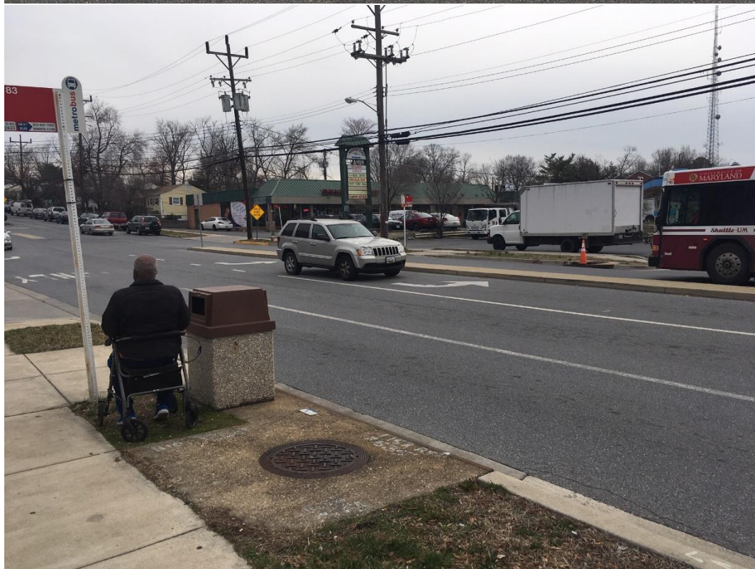
Across the Street