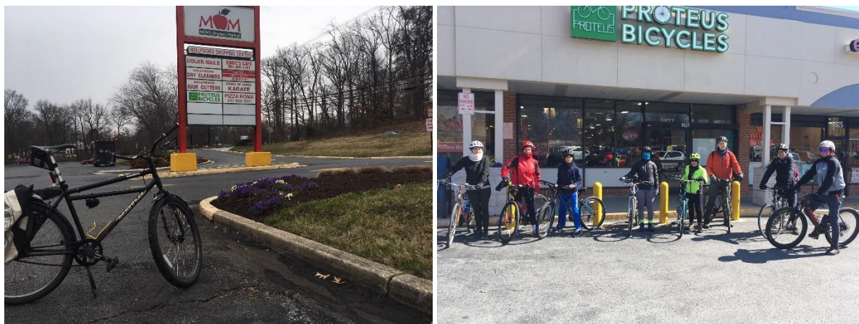
Hollywood Center (North College Park, MD)

Attachments: Photos of the bike shop, our strip and other nearby businesses next to Proteus Bicycles