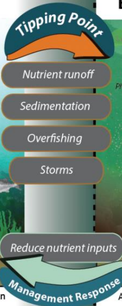
Basic SAV diagram: Source Oceaantippingpo

Agricultural and urban runoff has impaired the Bay's water quality and led to low or no oxygen zones that cannot support most marine life