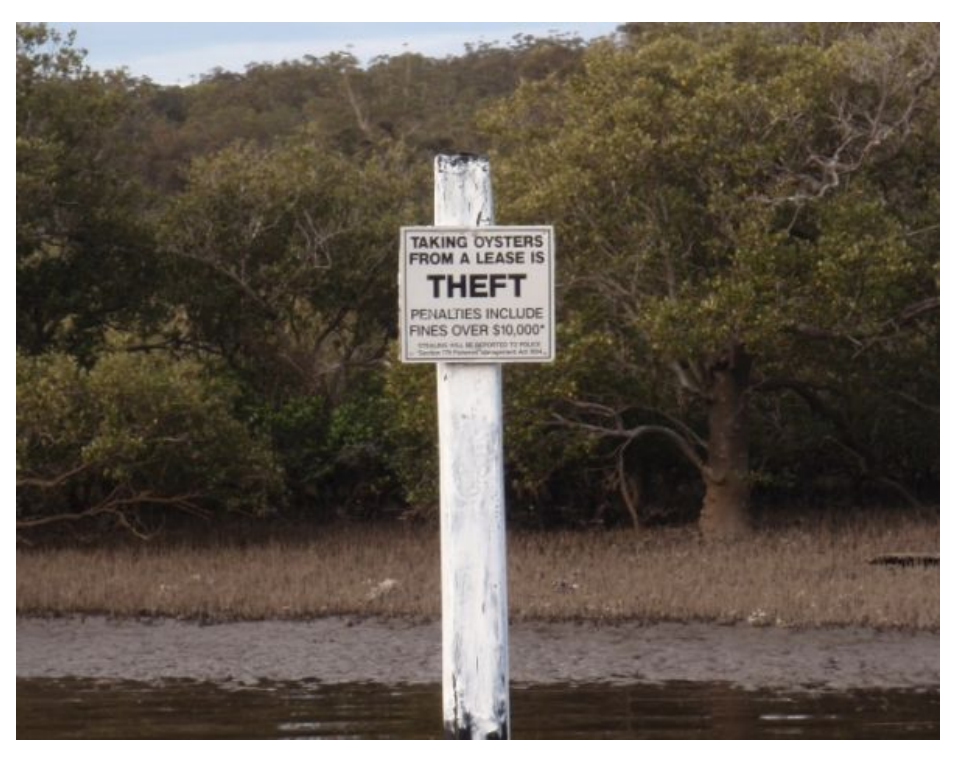
Figure B . A sign in New South Wales, Australia, used as a deterrent to oyster aquaculture theft. "Oyster Theft Deterrent." (2014). NSW Government: Department of Primary Industries. Retrieved from https://www.dpi.nsw.gov.au/ data/assets/pdf file/0009/638199/oyster-theft-prevention.pdf.