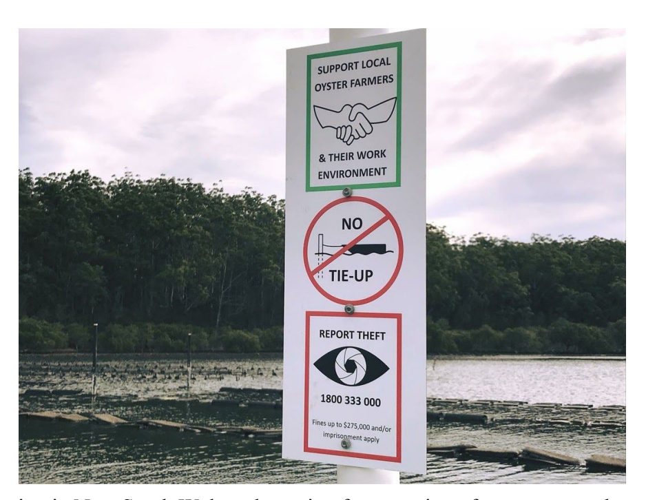
Figure C . A sign in New South Wales advocating for reporting of oyster aquaculture theft. "NSW Oysters." (n.d.). Oceanwatch Australia. Retrieved from https://www.nswoysters.com.au/theft-lease-damage.html.