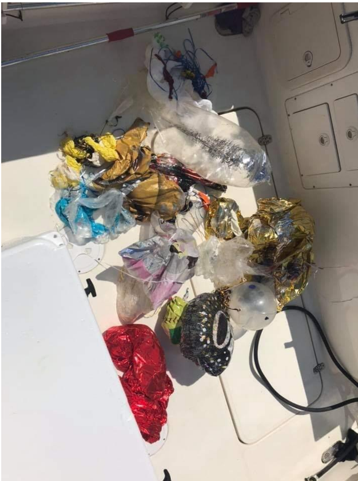
A bundle of balloons picked up in the Washington Canyon in July of 2019.