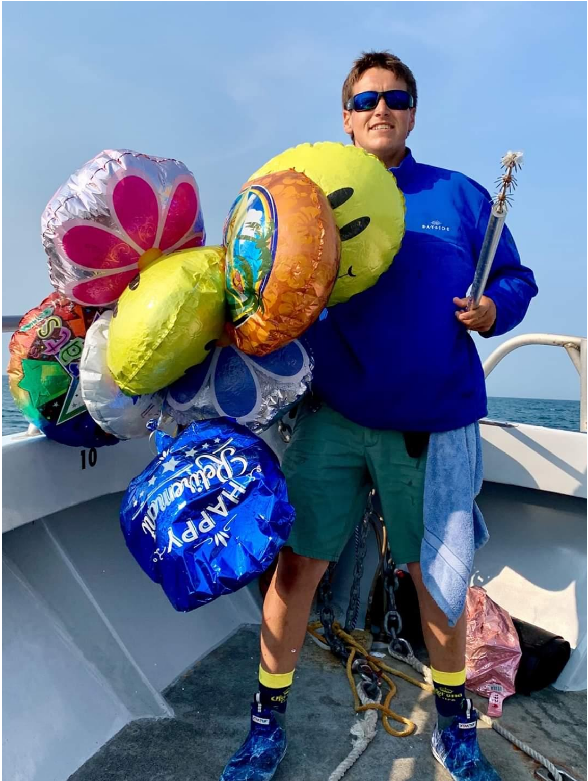
14 balloons retrieved by the Morning Star 15 miles off of Ocean City in October of 2019.