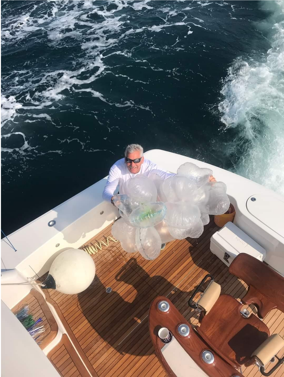
These 25 balloons were retrieved by the Reel Toy 20 miles off of Ocean City Md.