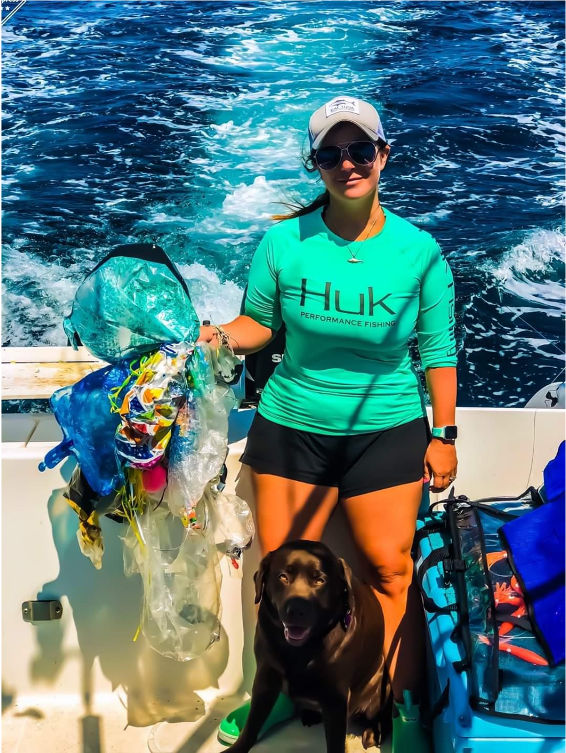
These 10 balloons were picked up by the boat Reel Lucky in the Baltimore Canyon on 7/16/19