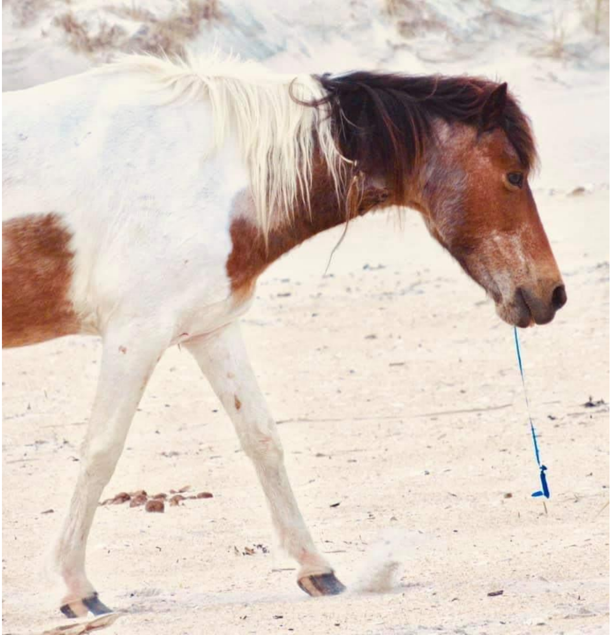
Assateague Island Pony with balloon ribbon tangled in its mouth.