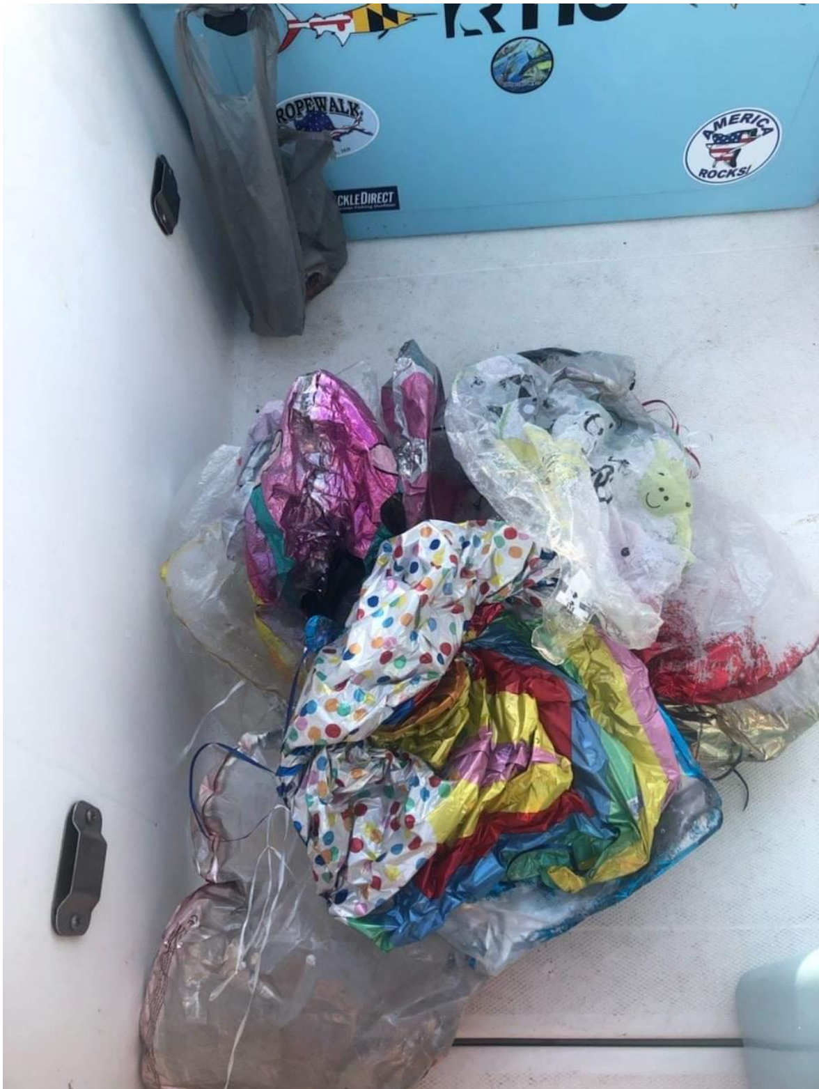
A bundle of balloons recovered by the Reel Lucky in the Canyons off of Ocean City Md on 7/25/19.