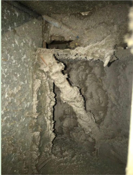
Figure 7 - Apartment 808 B Ventilation Duct