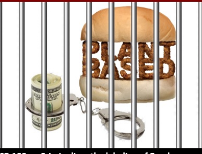
SB 188 — Criminalizes the labeling of Food as a "Veggie Meat" for up to 1 year of prison & up to a $10K fine

According to the 2018 Maryland Correction Enterprises (MCE) annual report, food services is one of the top work skills taught to inmates. If SB 188 is passed, returned citizens would be banned from using their skills to sell plant-based food labeled as "veggie chicken" without the threat of going back to jail.