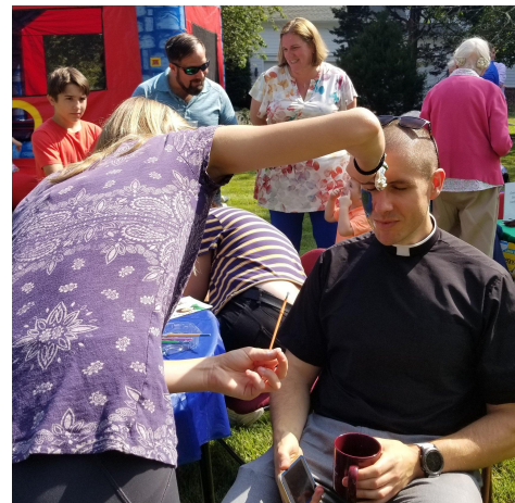
Members of Emmanuel Lutheran Church in Bethesda worship together, then hold an outdoor Creation care festival.