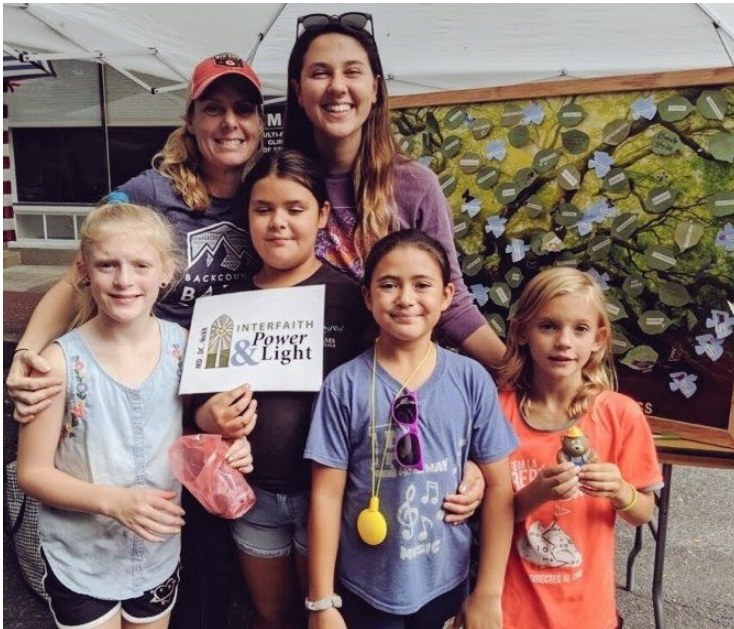
In Frederick, people of faith pledge to act on climate and sign petitions in support of public transit funding.