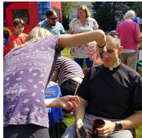
Members of Emmanuel Lutheran Church in Bethesda worship together, then hold an outdoor Creation care festival.