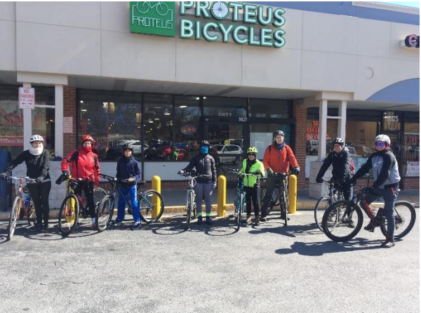
Hollywood Center (North College Park, MD)