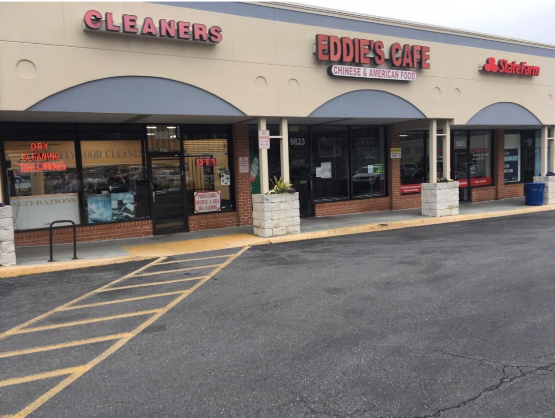
Hollywood Shopping Center