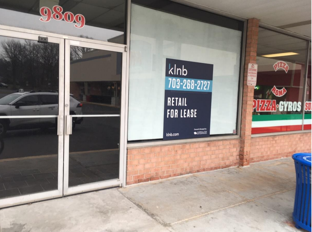
Vacant Storefronts for Several Years