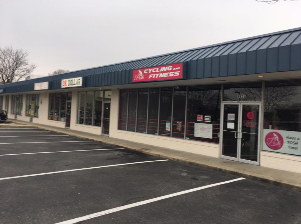
Neighborhood Old and New – Thrift Store (top), New Spin Studio (bottom)