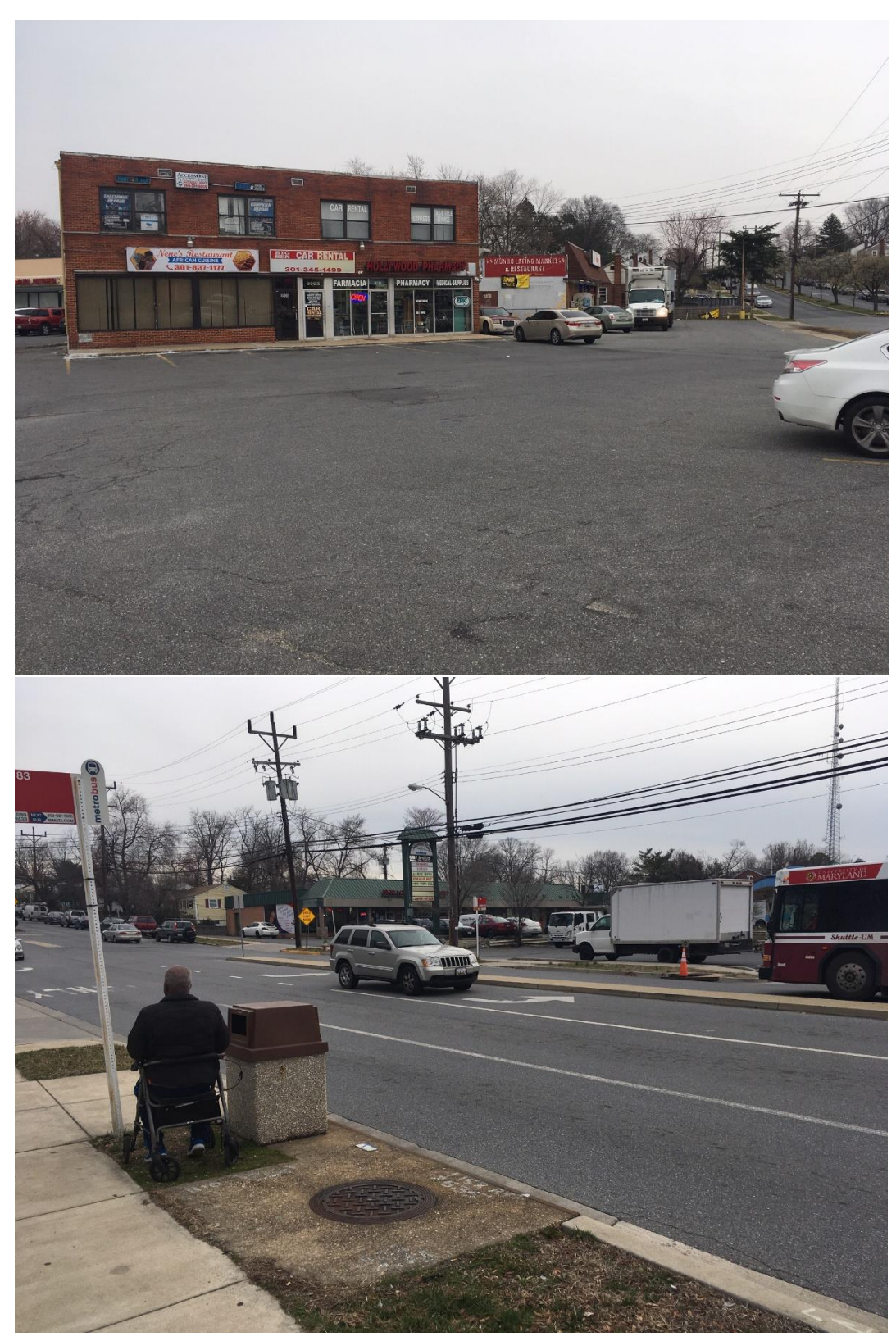
Across the Street