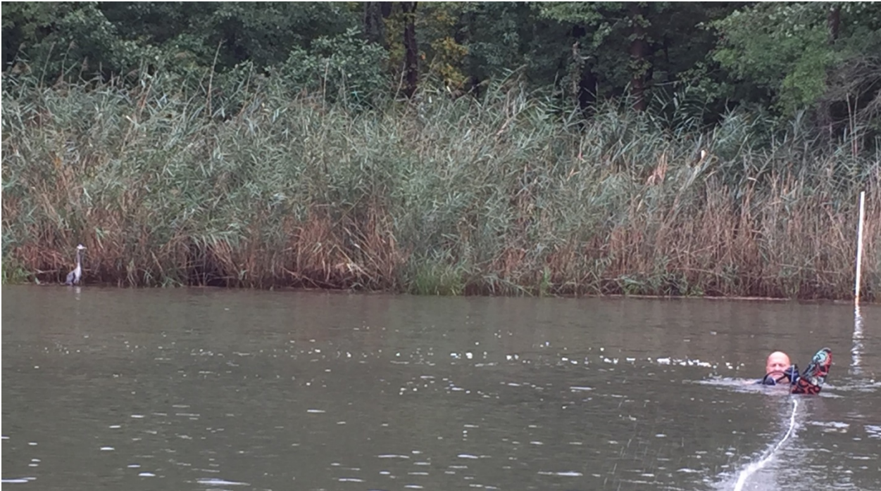
Exhibit 4: Water Skier