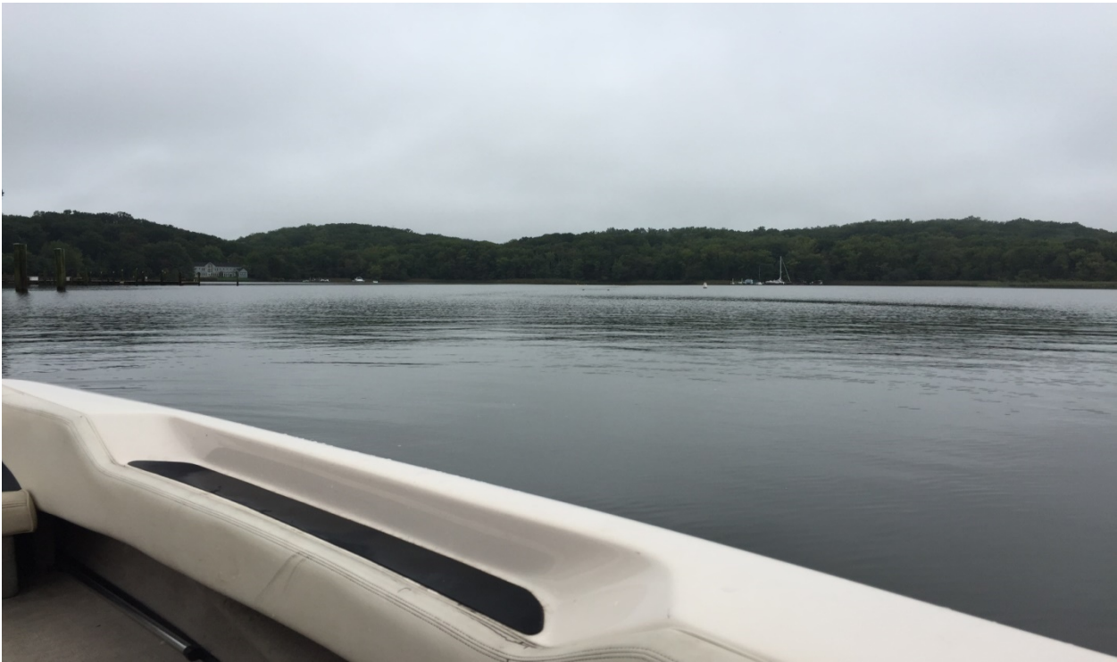
EXHIBIT 2: Pictures of Ski Course: Space for Everyone in Maynadier.