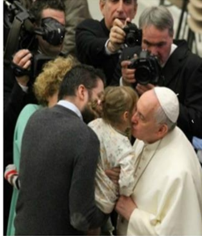
Pope Francis greets pilgrims present in the Vatican's Paul VI Hall for his Jan. 28, 2015 general audience.

Pope Francis directed his words to pilgrims gathered in the Vatican's Paul VI Hall for his Wednesday address. Continuing his catechesis on the family, the Pope spoke on the theme of fatherhood.