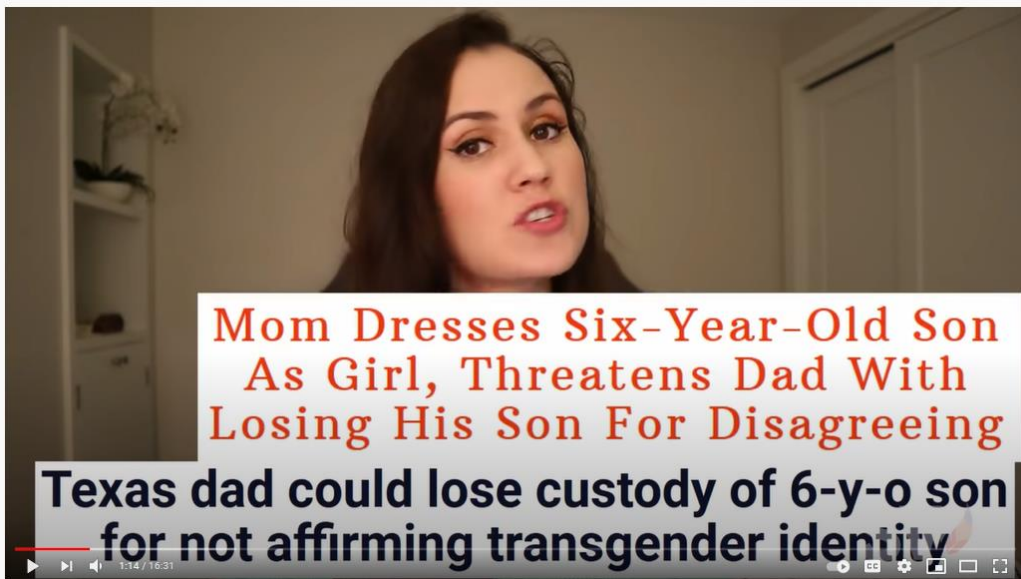
Forcing kids to transition: two horrific cases that EVERYONE needs to know