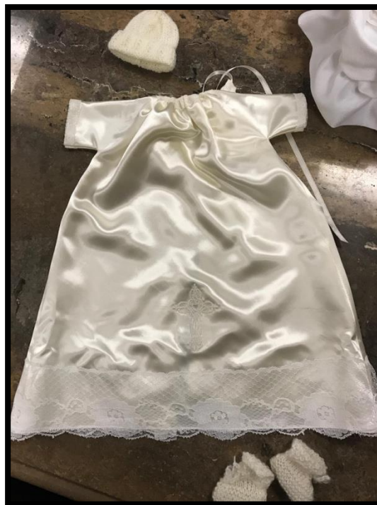
Burial Gown, Isaiah's Promise