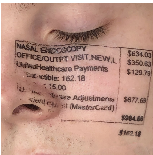
Image description: Declan McKenna's face is shown, with a temporary tattoo listing the surgery costs for a "Nasal Endoscopy" covering his skin. The total cost for the treatment being $984.66