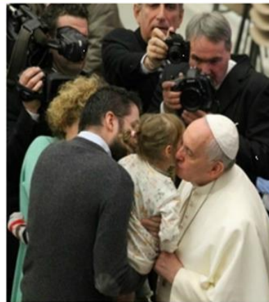
Pope Francis greets pilgrims present in the Vatican’s Paul VI Hall for his Jan. 28, 2015 general audience.

Pope Francis directed his words to pilgrims gathered in the Vatican’s Paul VI Hall for his Wednesday address. Continuing his catechesis on the family, the Pope spoke on the theme of fatherhood.