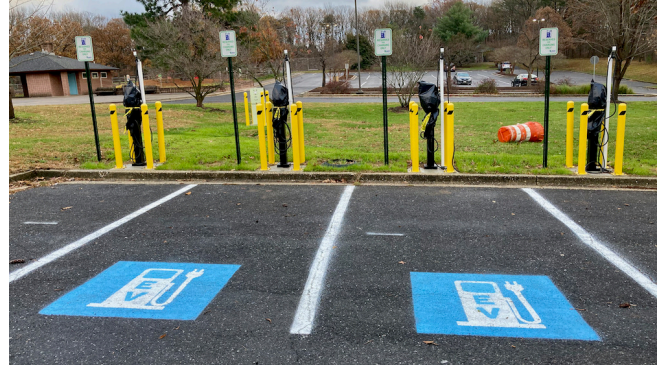
Pepco, Greenbelt, MD