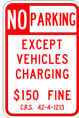
Colorado DOT R7-113q Regulatory Sign Sign Specifications Website