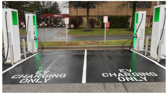
Electrify America, Columbia, MD