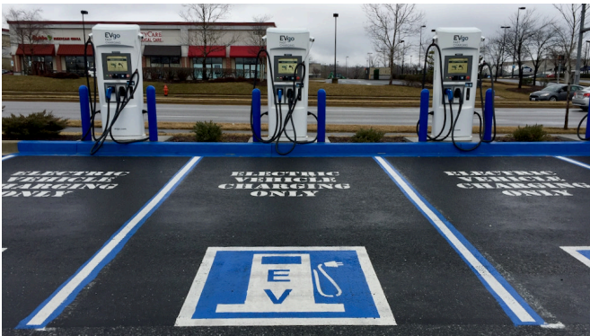
EVgo, Nottingham, MD