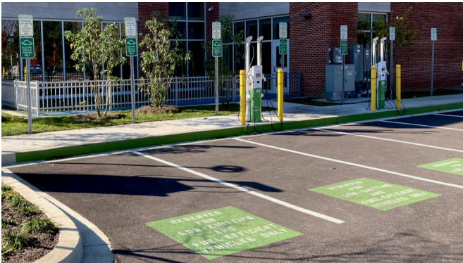
West Library, Annapolis MD