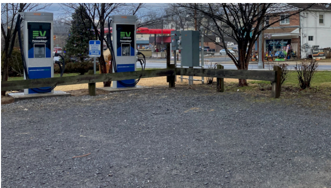
Potomac Edison, Hancock MD (gravel)