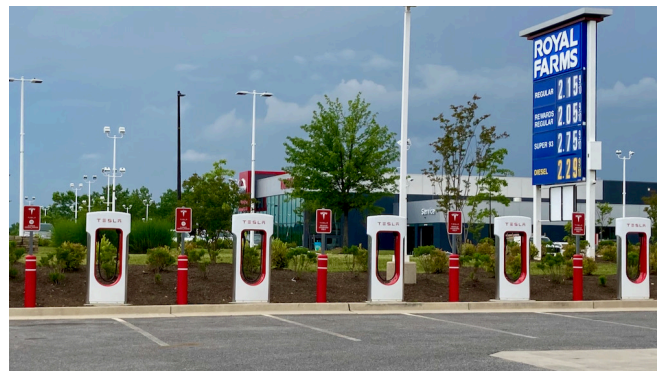
Tesla at Royal Farms, White Marsh MD