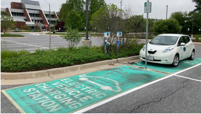
Howard County Offices, Ellicott City, MD