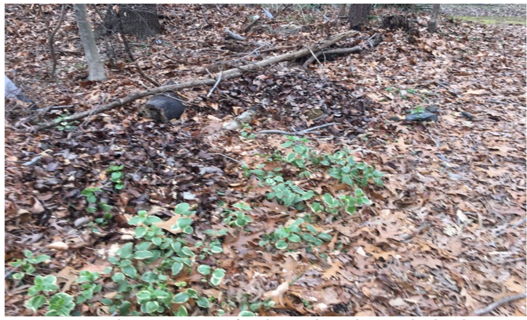
Invasive plants growing out of yard waste dumped in Maryland park.