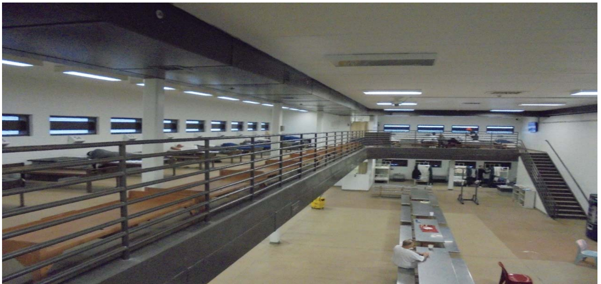
Figure 1. Hendricks Hall where low custody detainees are housed, as observed by DHS Office of Inspector General (OIG) on December 17, 2019.

We reviewed HCDC's strip-search log from August to December 2019 and found that HCDC staff conducted 35 strip searches of low custody detainees, with 1 detainee strip searched 13 times. In addition, HCDC staff did not consistently include the purpose for the strip search, and we were unable to identify why most of the strip searches occurred. The facility did not provide documentation showing reasonable suspicion that detainees were in possession of contraband or why leaving the housing unit created an increased risk of detainees transporting contraband to other parts of the facility. Because low custody detainees have minimal to no contact with high custody detainees or high-level inmates, even when outside the east wing, it was unclear why the facility believed detainees would spread contraband to other parts of the facility. Further, HCDC reported no incidents of low custody detainees caught with contraband. Figure 2 shows entries from HCDC's stripsearch log.