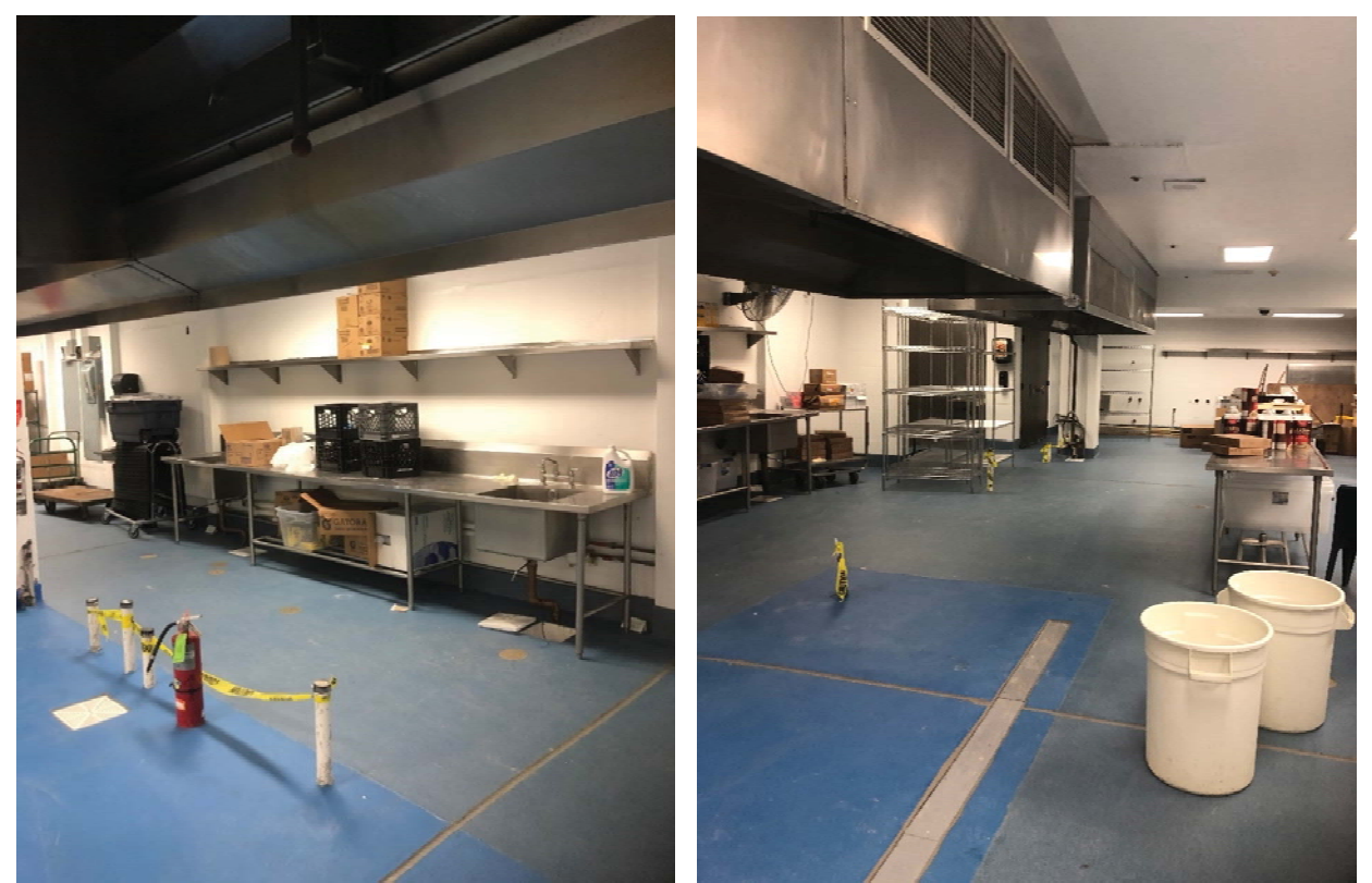
Figure 3. HCDC's kitchen undergoing renovation as observed by DHS OIG on December 17, 2019.

The HCDC kitchen renovation began in June 2019, and was expected to be completed within 30 to 45 days, but was delayed several times because of the time it took HCDC to get kitchen equipment purchased, delivered, and installed. It was not until about 8 months after renovations began that the kitchen reopened. During this entire period, detainees at HCDC received only one hot meal per day. Of the 61 ICE detainees at HCDC during our visit, 36 detainees had received only one hot meal per day for more than 30 days, with 2 of those detainees receiving only one hot meal per day for more than 5 months. We asked HCDC officials why they did not work with DRCF to provide detainees with two hot meals. HCDC officials stated they lacked the budget to pay DRCF to produce another hot meal and DRCF could not handle the workload of producing and transporting two hot meals per day.