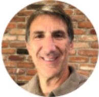
By Karl Dierenbach

COVID has clearly been devastating. But our reaction has turned a bad pandemic into an unrivaled self-inflicted national disaster.