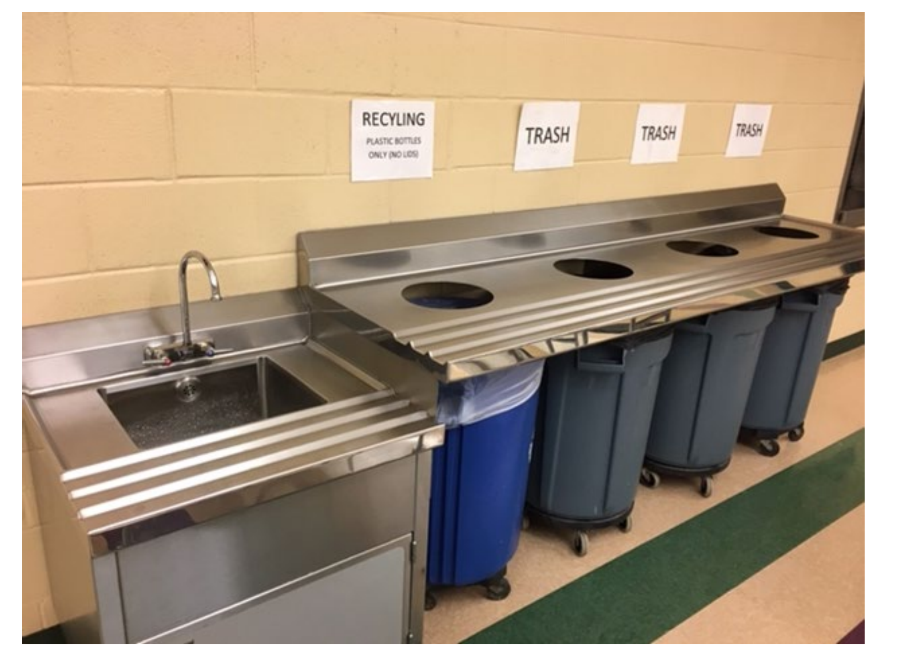
School with a constructed design in a new facility