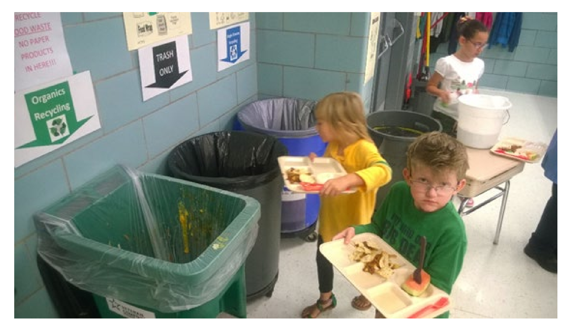
School without a non-functioning system