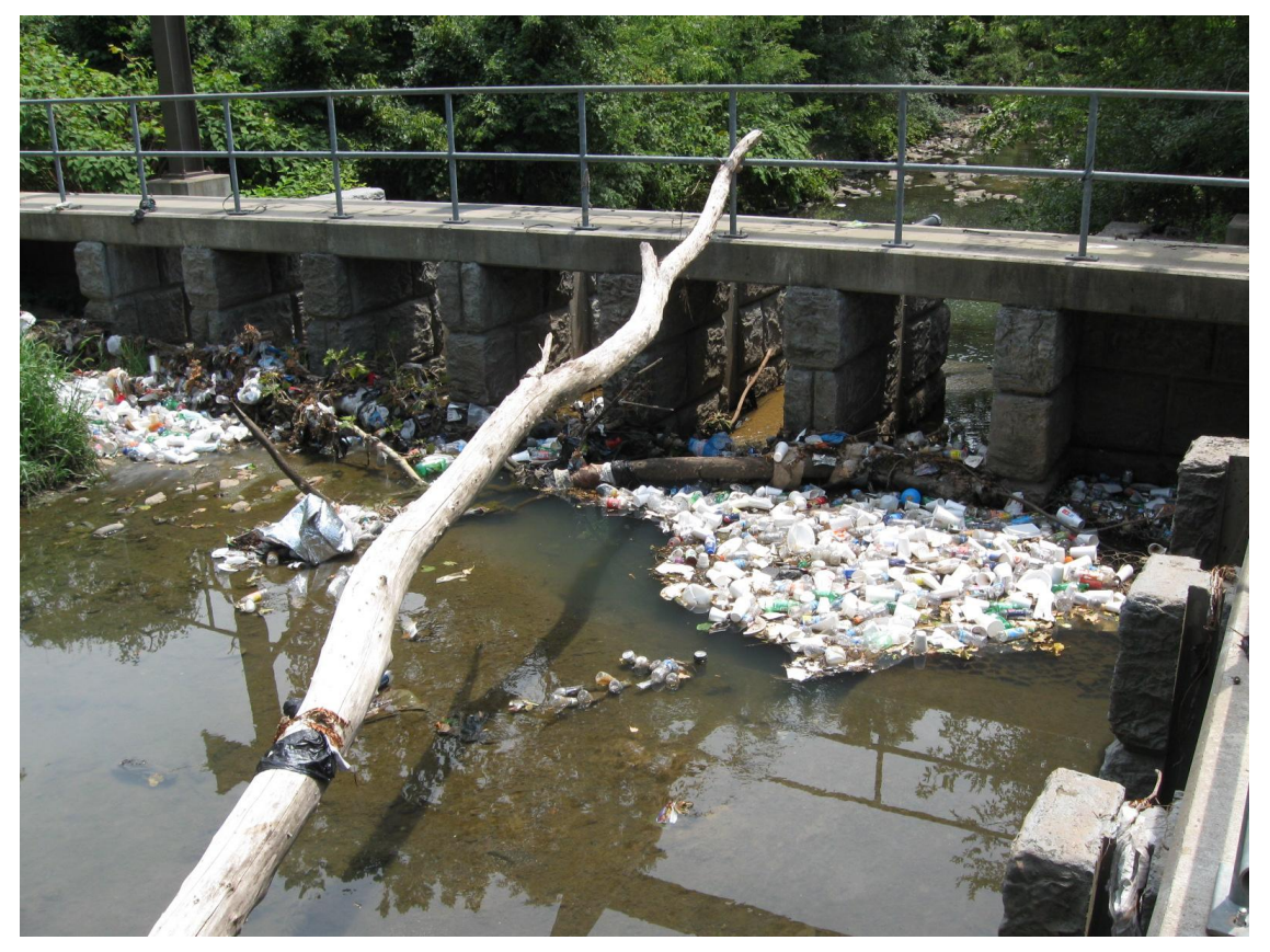
Gwynns Run, Baltimore, MD.