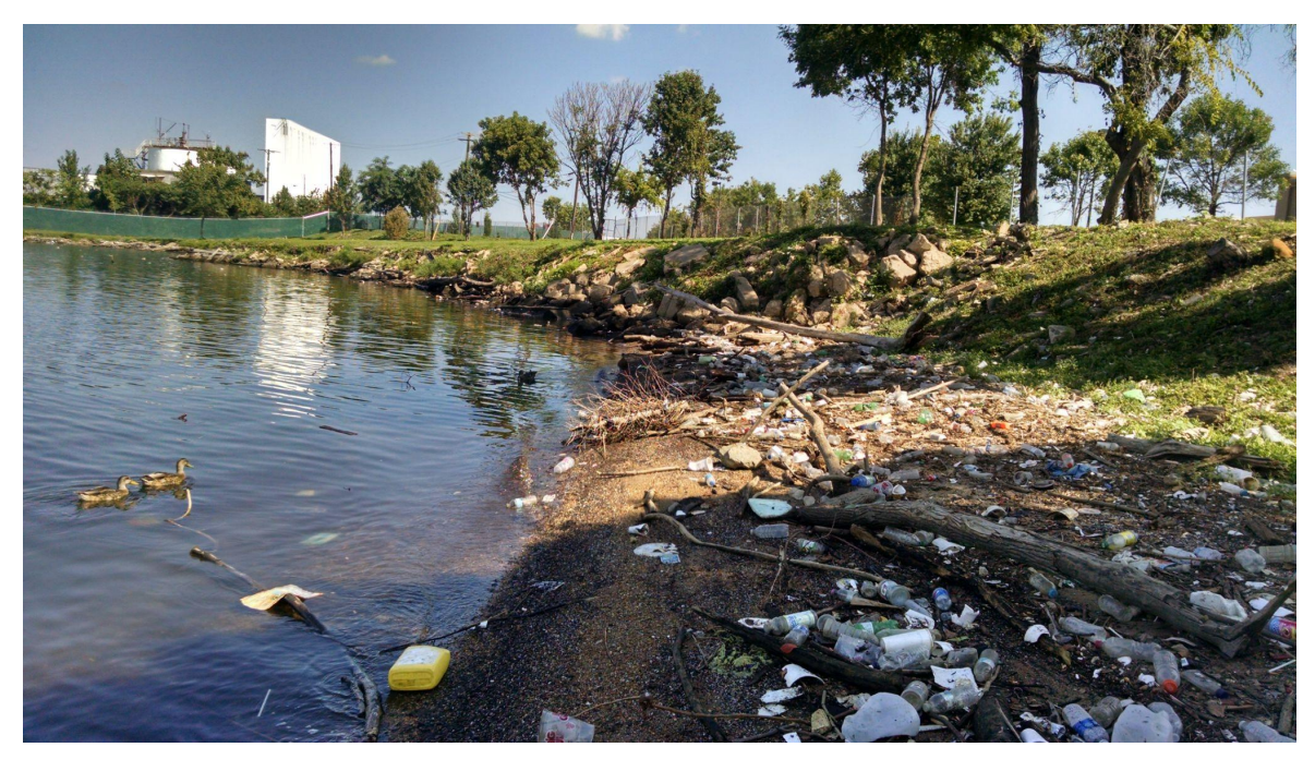
Ferry Bar Park, Baltimore, MD.