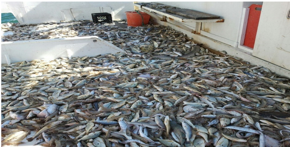
Figure 2: shrimp trawl bycatch