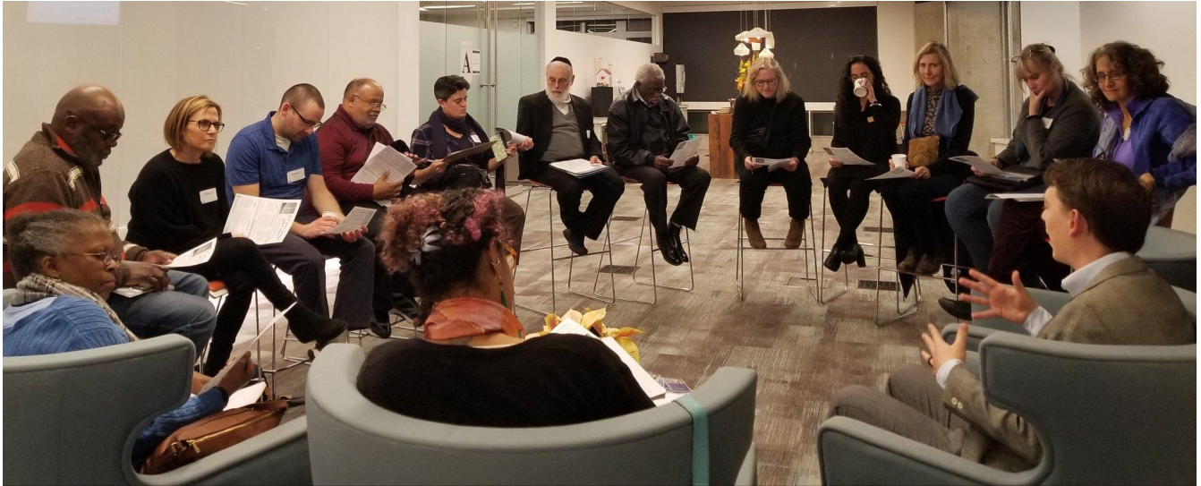
Attendees at a December 2019 event in Baltimore convened by the Baltimore Jewish Council, the Pearlstone Center, and The Associated: Jewish Federation of Baltimore learn about the Maryland Constitutional Amendment for Environmental Human Rights. Congregations across Maryland are drawn to the Amendment as both an expression of our principles and a concrete way to care for our neighbors and Creation.