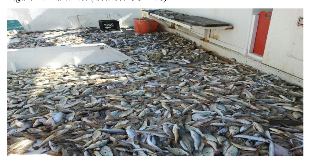
Figure 2: shrimp trawl bycatch