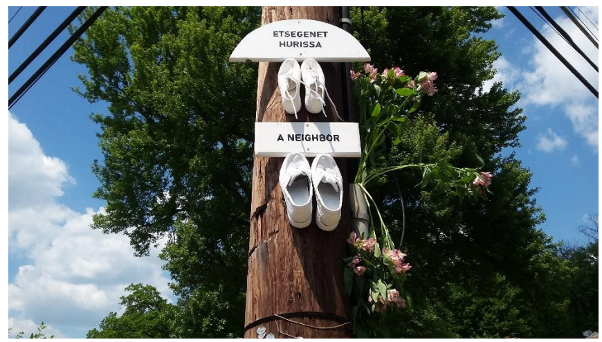
Georgia Ave/MD97 and Regina Drive/Rippling Brook Drive, Aspen Hill