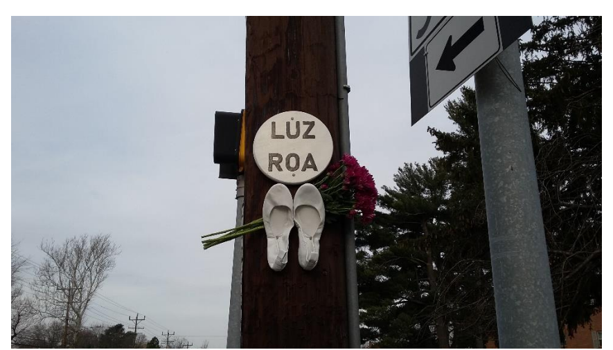
Veirs Mill Rd/MD 586 & Ferrara Avenue, Wheaton