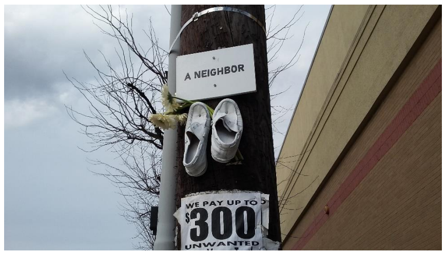
New Hampshire Avenue/MD650 and Elton Road, Hillandale

(Note: yet another pedestrian, a 70-year-old man, was killed at this intersection on January 17, 2022)