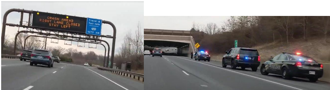
MD 200 ICC, 5:00pm, Sunday, March 6, 2022, eastbound, pick-up truck collision, 180 degrees turnaround

From our first-hand experience, those who live within 1-2 miles on either side of the ICC hear speeding vehicles of all kinds all day and into the night. They also hear the sirens of first responders called to the scenes from our local fire and police departments, putting themselves at risk of death or severe injury from drivers who neglect to slow down and move to another lane.