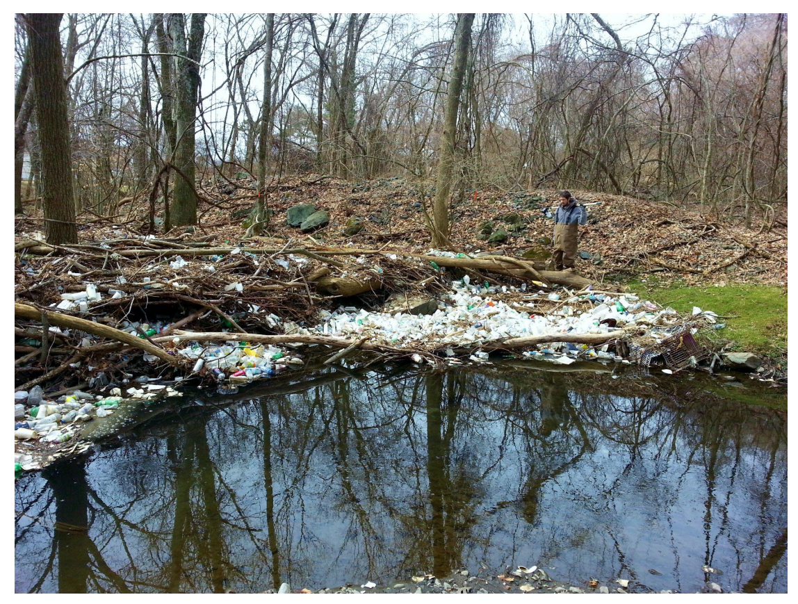
Powder Mill Run, Baltimore, MD.