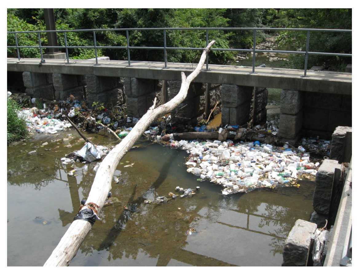
Gwynns Run, Baltimore, MD.