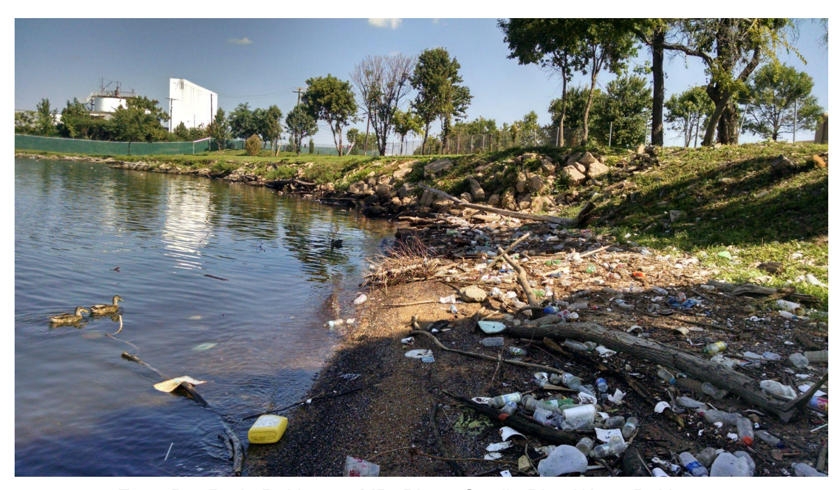
Ferry Bar Park, Baltimore, MD.