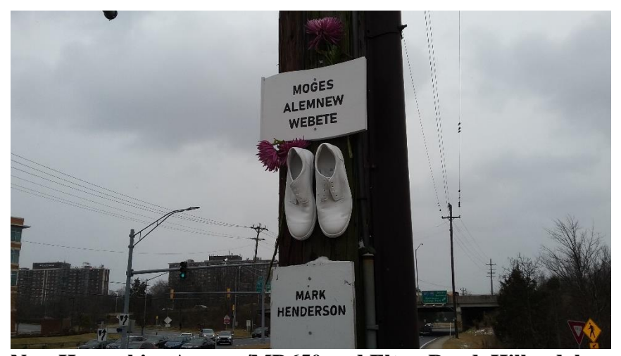
New Hampshire Avenue/MD650 and Elton Road, Hillandale