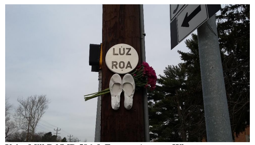
Veirs Mill Rd/MD 586 & Ferrara Avenue, Wheaton