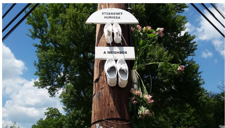
Georgia Ave/MD97 and Regina Drive/Rippling Brook Drive, Aspen Hill