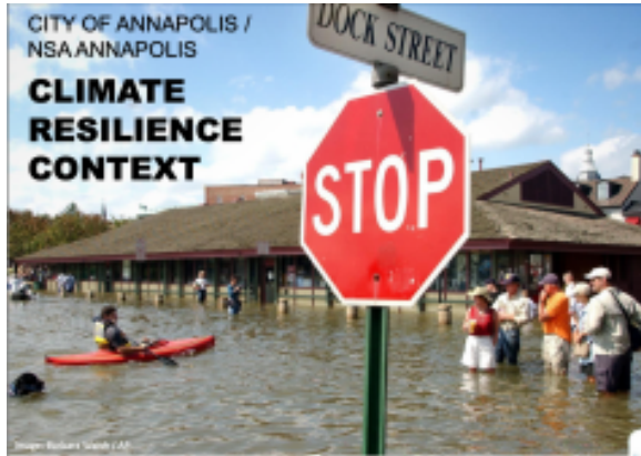
Exhibit 1. City of Annapolis Climate Report Current values and events: :