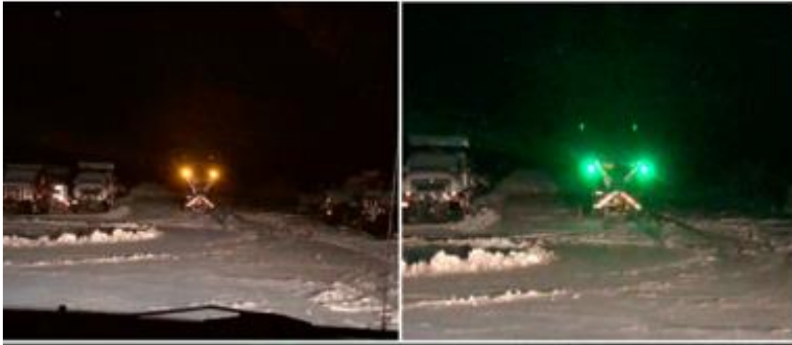
Beacons (switch between single flash green and quad flash amber)