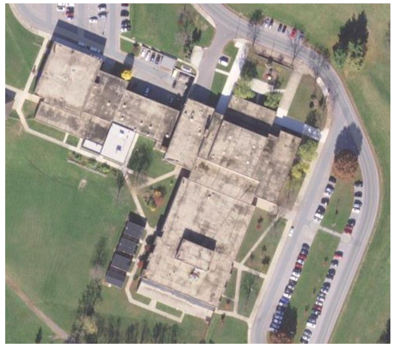
Williamsport High School Polling Location for district-precinct 02-000