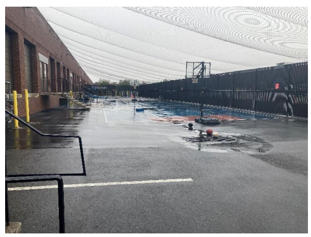
Exhibit 2: Monocacy Valley Montessori Public Charter School Entrance and Blacktop Playspace