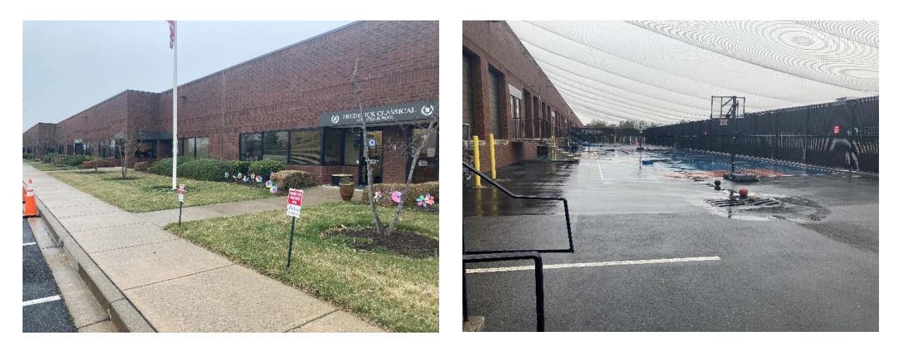
Exhibit 1: Frederick Classical Charter School Entrance and Outdoor Playspace